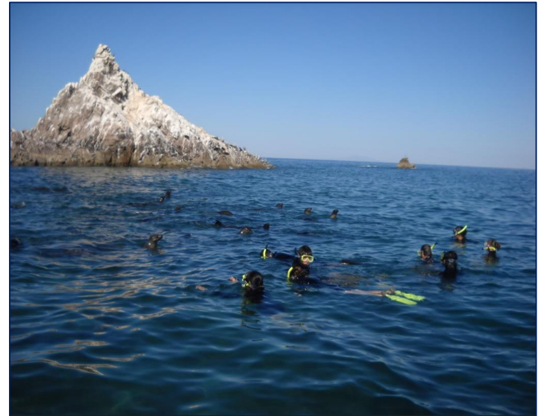
CEDO – Nature Artes