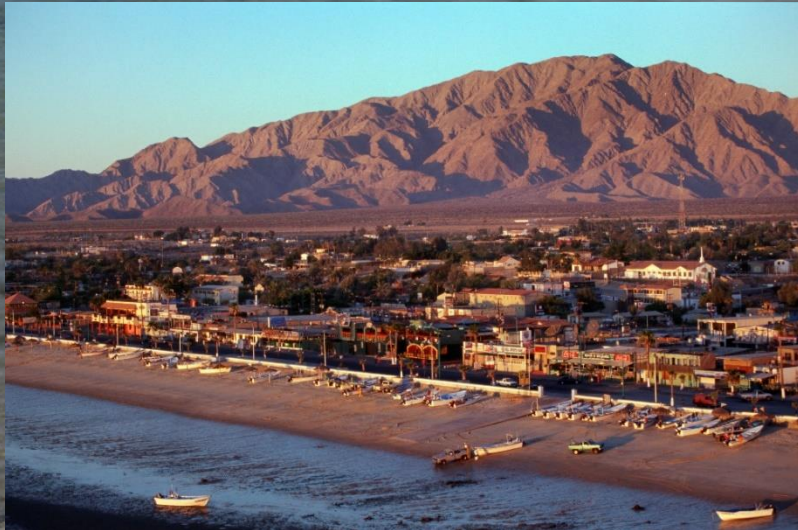
San Felipe, Baja California

http://www.history.com/topics/mexico/baja-california/pictures/baja-california/san-felipe-in-early-morning