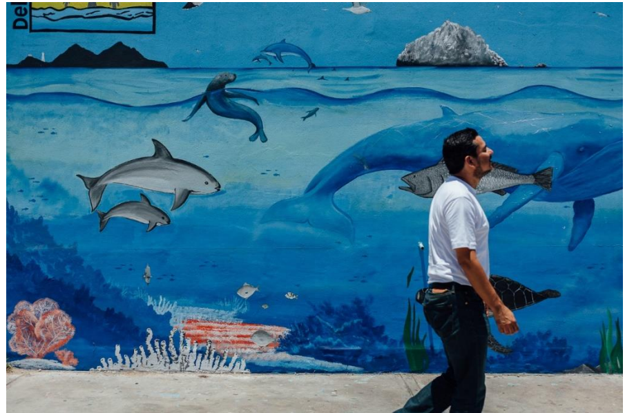
Plantar de Agua Mar de Cortés, San Felipe