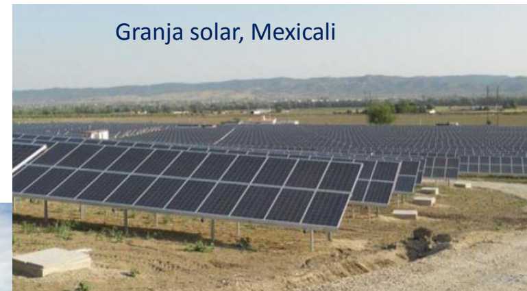
Granja solar, Mexicali