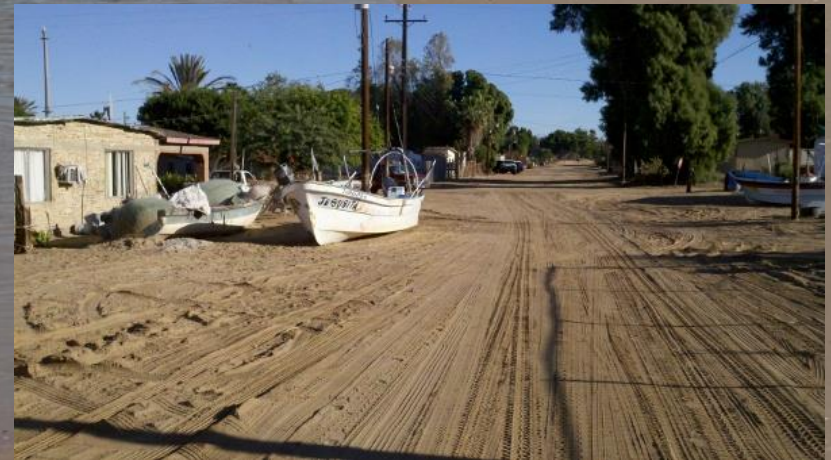
El Golfo de Santa Clara, Sonora

http://www.coati.com/MexicoCATrip/NorthernMexico.html