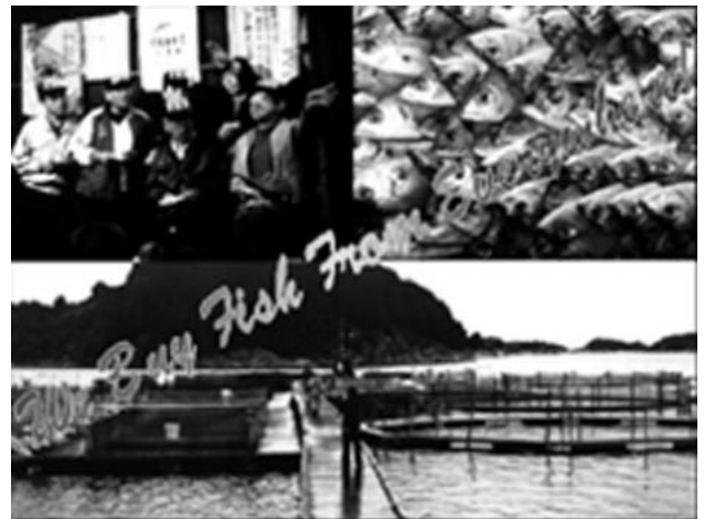
Figure 3. We Buy Fish... Cultured Fish are Nice - With Sushi Rice, and Served Everyday for Lunch...

Asia's markets dominate the worlds fisheries.