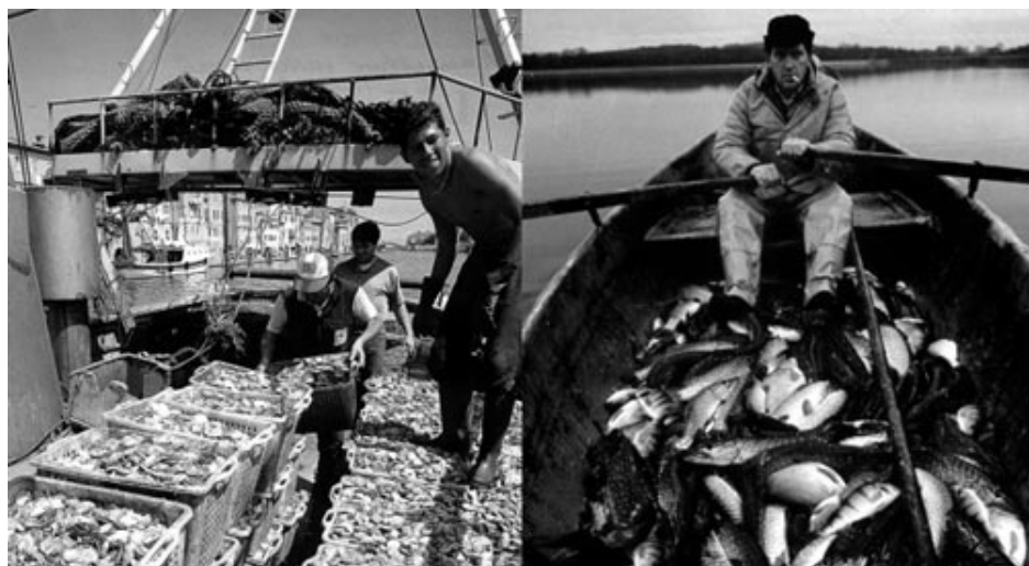
Figure 1. Modern aquaculture facilities provide options for many, around the world. Salmon pens (Norway), oysters and various ocean fishes (Italy) represent the fruit of many centuries of trial and error, evolving into modern fisheries science.