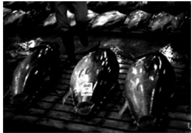
Figure 2 Bluefin tuna can arrive at Tsukiji, or other market floors from anyplace in the world, within 24 hours of being landed, or taken from any of many grow-out facilities around the world.

Chile exports a large proportion of its immense pelagic fisheries products to Asia for feeding other fishes and shrimp.