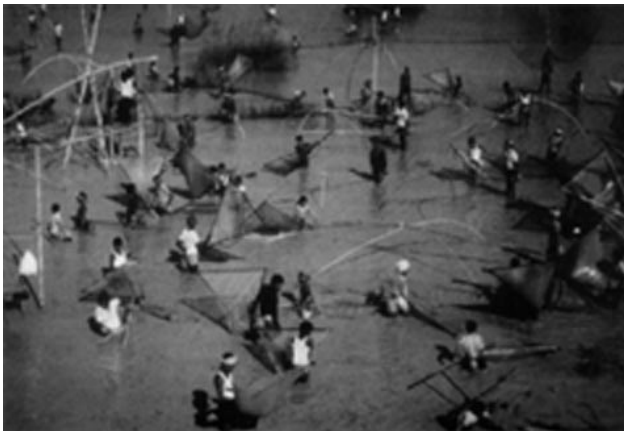
Figure 1. Fishers for shrimp post-larvae to supply shrimp farms in Bangladesh, filtering their environment.

In the late 1970s, the Asian Development Bank initiated an Aquaculture Development Program to encourage shrimp culture within the vast coastal environments of Southeast Asia. The results were spectacular, in the short term, but the increased expansion of farms created environmental and social disasters. Entire mangrove systems were removed - general environmental degradation ensued from pond effluents. Local fisheries were decimated, as mangrove- dependent fish production declined, and the intense pressure due to the need for shrimp post-larvae increased - to stock the ponds - and... The Competition for the "Commons" Created - Chaos!