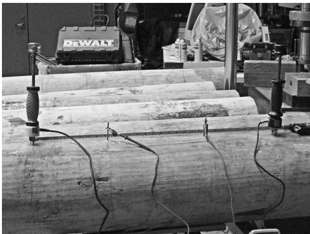
Figure 1.—Locations of moisture meter pins and nails used to measure conductivity and resistance, respectively, in Douglas-fir pole sections treated with pentachlorophenol or copper naphthenate or left untreated.

The moisture meter pins at each location were then used to measure moisture content. Independent moisture meter measurements were made using a Delmhorst Model RDM-25 moisture meter equipped with 37-mm-long pins.