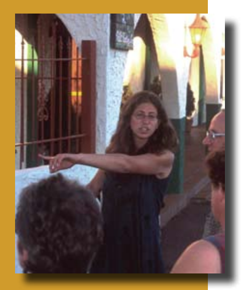
Touring the market site the night before an RMA

stand-alone exercises undertaken by individual markets, a CCO is a part of a complete RMA.