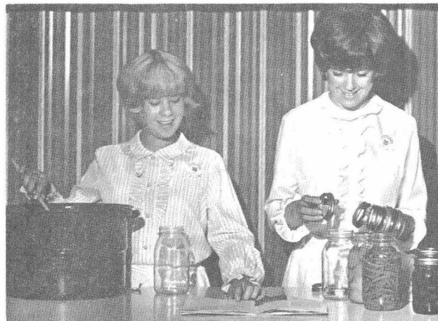
Members of 4-H clubs learn how to preserve many foods which can be enjoyed by the family all year in the food preservation project.

and resourceful citizens. There are 946 members enrolled led by 175 adult leaders. Membership by division is: Brownies, 469; Juniors, 369; Cadets, 83; and Seniors, 25. The program reaches youth 7-17 years old.