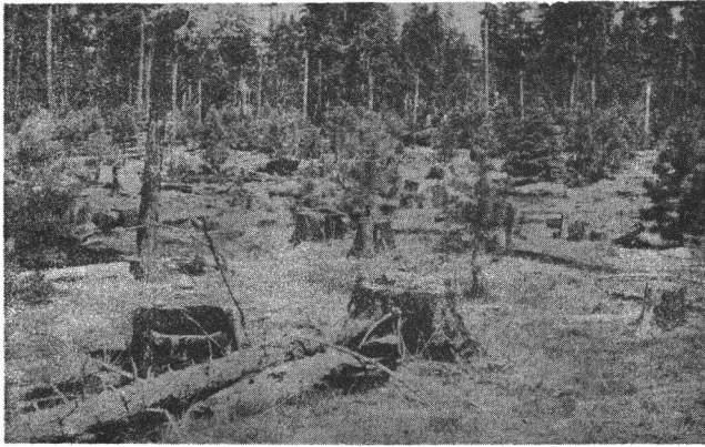
Reforestation of cut over areas by planting trees assures a continuing forest industry for Jackson County.