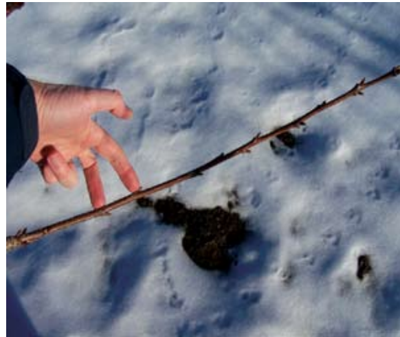
Figure 1. The flowering spurs that will form at the base of the previous season's shoot growth will be spaced farther apart, and will have fewer flowers per spur, than those that will form at the tip of that growth.

of last year's new growth from every shoot during the dormant season, a substantial portion of the future crop can be eliminated. In fact, since terminal spurs produce more flowers than basal spurs and are closer together (Figure 1), removing one-third of the new growth will reduce a branch's fruiting potential by about one-half.