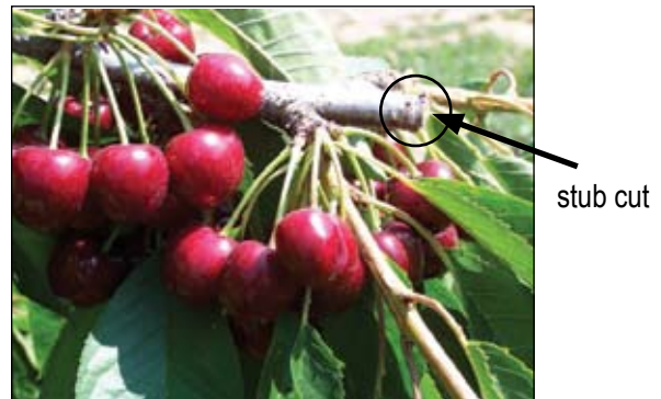
Step 2. Make stub cuts to reduce the current season's crop and force renewal of older fruiting branches and spurs.

Why: Reduces current crop and renews spurs.