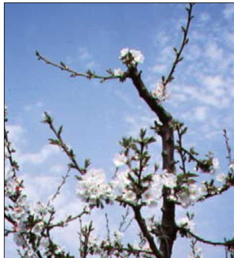
Step 3. Thin branches for light penetration.

Why: Allows light to penetrate the center and bottom of the tree, maximizing photosynthesis and producing fruit throughout the canopy.