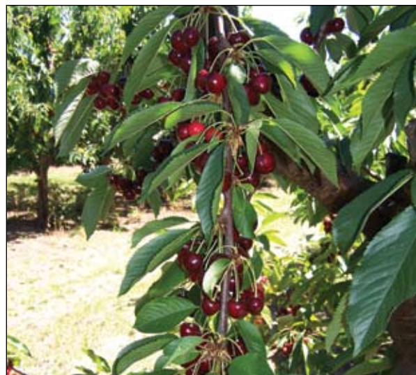
Step 1. Remove all pendant and small-diameter wood.

Why: Removes wood that tends to overset and produce small fruit.