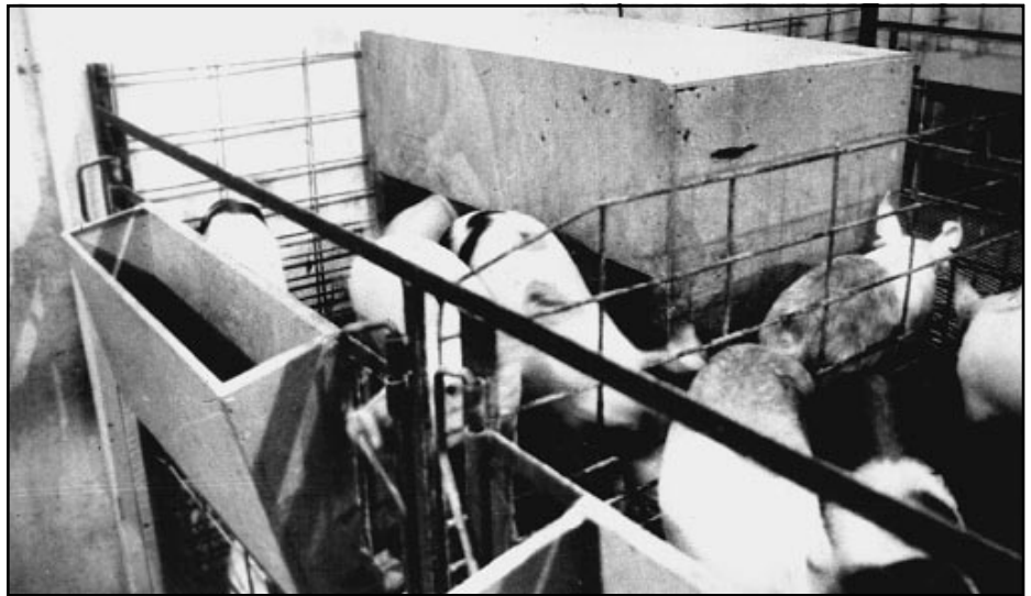
Figure 2.—Weaned pigs in a special hover area.

Most producers like to check baby pigs frequently. Placing a hover in the creep area reduces your ability to see them, but you can easily install a hinged lid to let you see into the hover.