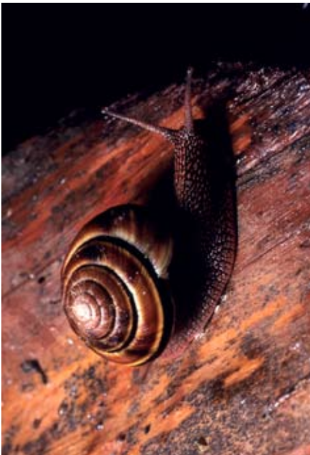
Figure 3. Snail.

Caution: When using these remedies, test your mixture on a small number of plants or a small part of a plant to evaluate possible toxic effects. Plants with hairy leaves tend to hold soap solution on their leaf surfaces, where it may burn. The greater the strength of the solution, the hotter the day, and/or the more a plant is water stressed, the greater the likelihood of burning.