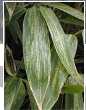
Figure 6. Spider mite damage.

Control. Mix 3 tablespoons of dishwashing soap with 1 gallon of water. Wet leaves thoroughly for good control. Reapply every 5 or 6 days if necessary. Rubbing alcohol can also be used to