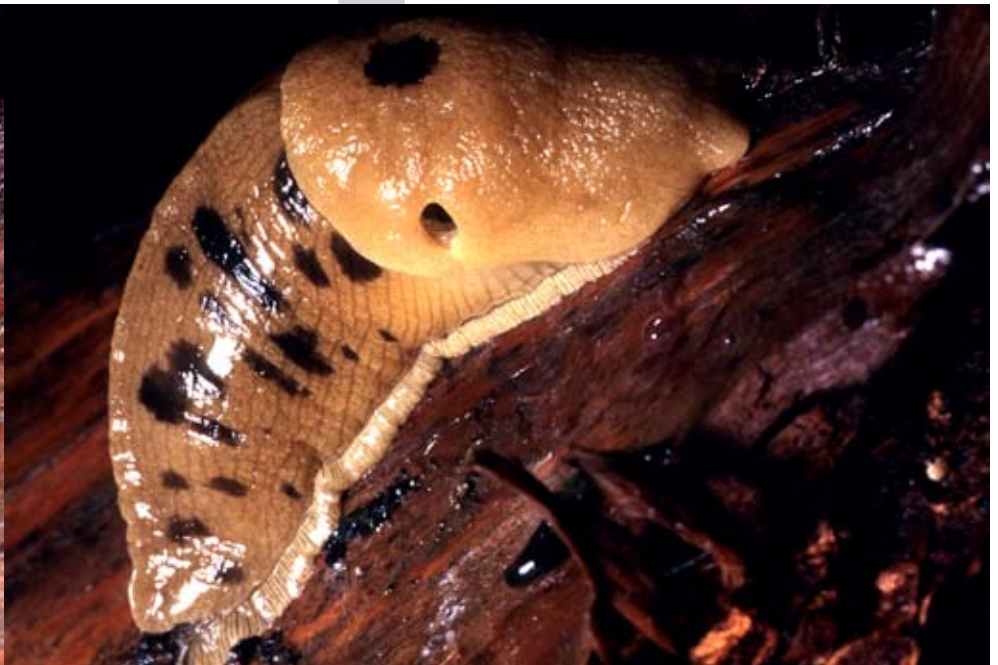
Figure 4. Slug.