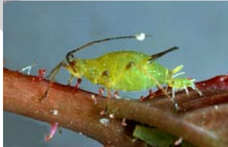
Figure 1. Aphid.

Damage. Symptoms of aphid damage include curled leaves (Figure 2), yellowish spots, and glossy leaves due to the presence of sticky honeydew. A “weeping” tree that drips a sticky substance commonly has an aphid infestation. Black sooty mold (due to a fungus) may develop on leaves. The presence of this mold may reduce photosynthesis, make the plant unattractive, and possibly reduce flowering and yields.