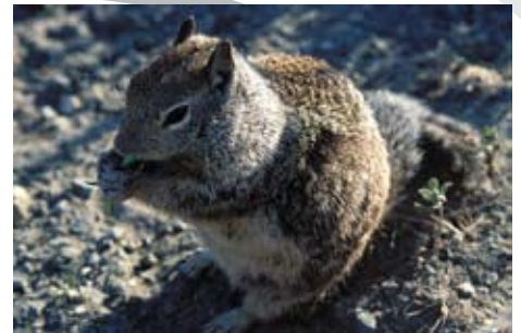
Figure 9. Ground squirrel.

You can repel moles, gophers, ground squirrels (Figure 9), and marmots by placing jalapeño peppers within 4 inches of where they are invading. For marmots and deer, you can use castor oil; electric fences also will repel deer. To control ants, saturate cotton balls with peppermint oil or mix the oil in a spray bottle with water (1 part peppermint oil to 10 parts water) and apply where needed. Hot water also works.