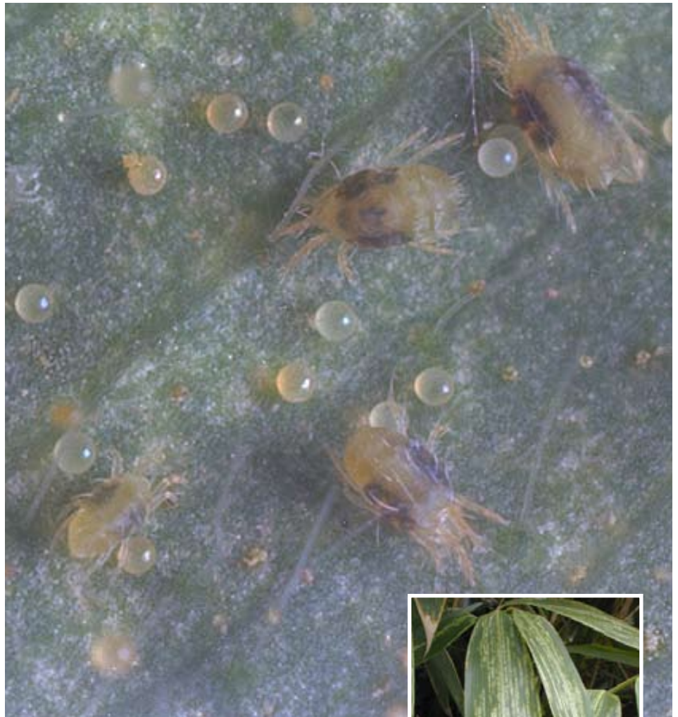
Figure 5. Spider mites.

Damage. Plants or leaves damaged by spider mites appear off-color. Close inspection reveals