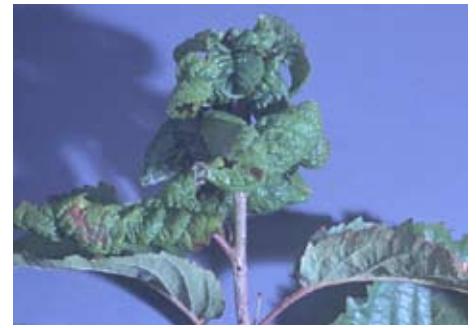
Figure 2. Aphid damage.

Control. Aphids breathe through spiracles or small breathing holes. Insecticidal soap, available at most garden centers, controls aphids by clogging their breathing holes. An alternative is to mix 1 teaspoon of vegetable oil, 1 teaspoon of dishwashing liquid, and 1 cup of water. Another option is a mix of 3 tablespoons of liquid soap and 1 gallon of water. This makes a 1 percent soap solution.