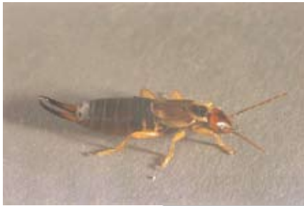
Figure 7. Earwig.

Earwigs can be recognized by the forceps-like pincers on the end of the abdomen (Figure 7). They have chewing mouthparts and feed primarily on decaying organic matter and other insect species, but they also chew holes in many flowers