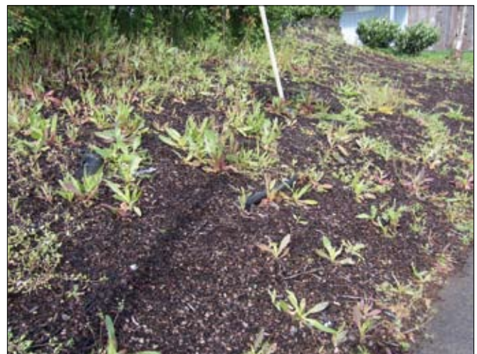
Figure 5.—Weeds are growing in the bark on top of this landscape cloth.