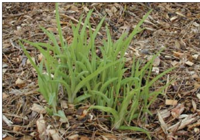
Figure 10.—Arborist mulch.

Partially decomposed leaves are known as leaf mulch or leaf mold (Figure 11). This product has a near-neutral pH (6 to 7.5). The C:N ratio typically is about 50:1 in fresh leaves, decreasing to below 20:1 when leaves are fully composted. Most leaves are a good source of potassium.