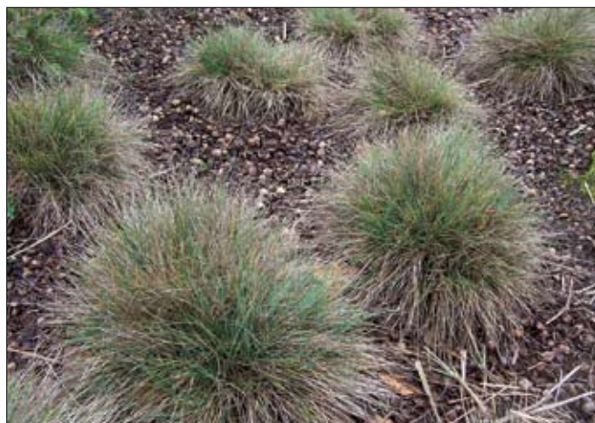
Figure 13.—Hazelnut shell mulch.

With wood chips or ground wood waste (arborist mulch), results usually are best by mulching 3 to