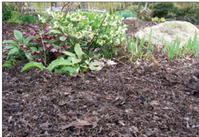
Figure 11.—Chopped leaves used as a mulch.