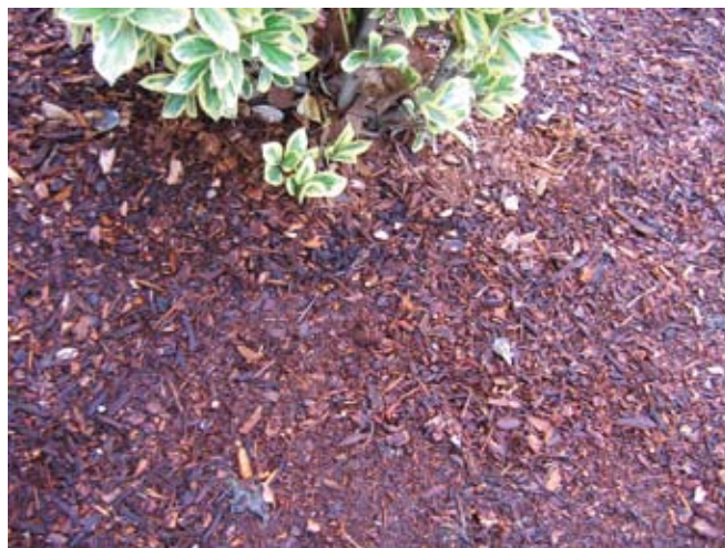
Figure 7.—Bark nuggets.

Wood chips (Figure 8) are made from the heartwood of a tree, as opposed to its bark. They may be manufactured from Douglas-fir, western redcedar, or hardwoods such as alder. Wood chips have a very