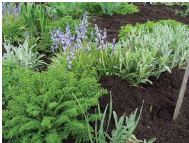
Figure 9.—Yard waste compost used as a mulch.