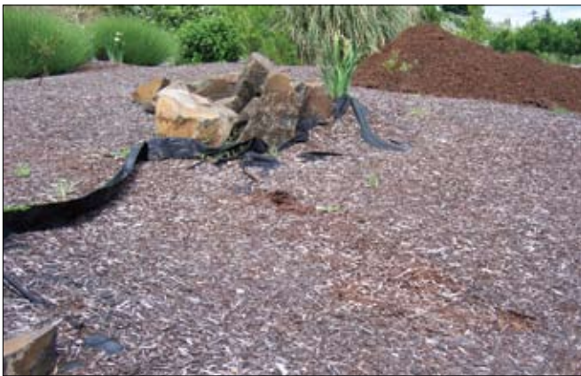
Figure 4.—Landscape cloth partly covered with bark.

Mulch needs to be at least 3 inches deep to smother existing weeds and prevent emergence of germinating seedlings.