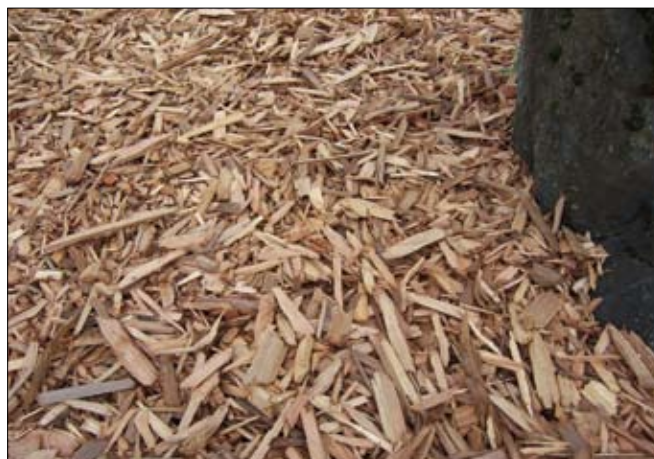
Figure 8.—Wood chip mulch.