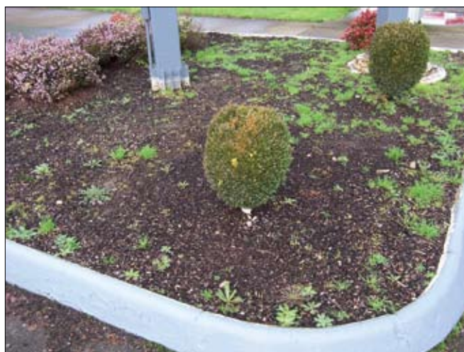
Figure 3.—Weeds growing in a sparsely planted, bark-mulched planting.

also can improve water infiltration by installing drip irrigation tubing under the soil surface.