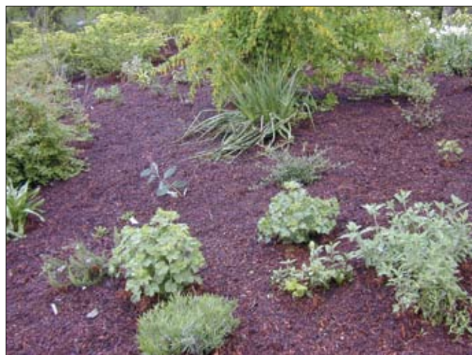
Figure 6. Bark mulch used in a landscape.