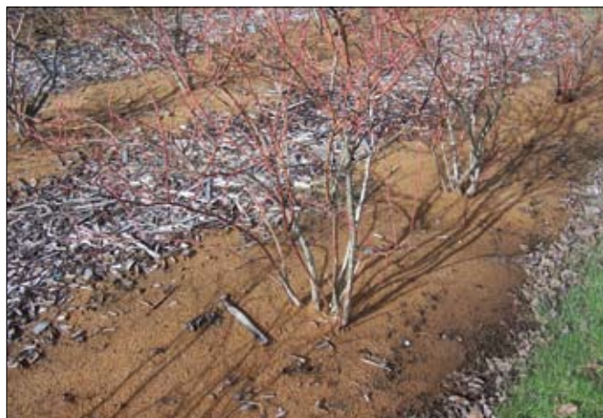
Figure 12.—Sawdust mulch on blueberries.

The fine texture of sawdust can allow it to crust over and repel water, reducing water infiltration. Do not use sawdust on slopes or where water might flow over the soil surface.