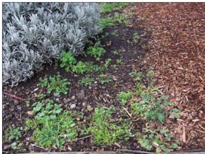
Figure 2.—The mulched area (right) contains fewer weeds than the unmulched area (left).

Always rough up the surface layer with a fork or other implement before adding more mulch. You