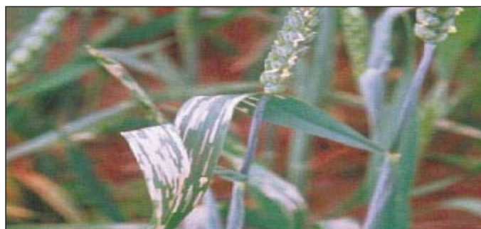
Figure 1.—CLB damage.

CLB larvae and adults prefer seedlings or new growth on older plants. Feeding generally is between leaf veins. Adults eat completely through leaves, but larvae eat long strips of tissue from the upper leaf surface and leave the translucent cuticle of the lower surface intact. This feeding pattern produces a characteristic “window-pane” look ( Figure 1 ). Tips of damaged leaves frequently turn white, giving heavily infested fields a frosted appearance.