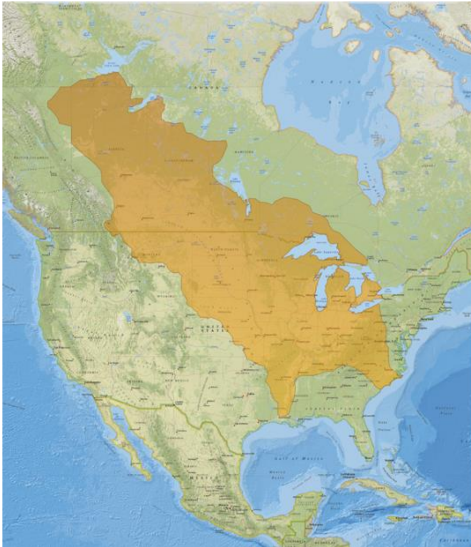
(Figure 3): Map of North America. An extent of Očeti Šakowij presence, linguistic base, intermarriage and co-management of lands indicated in yellow.