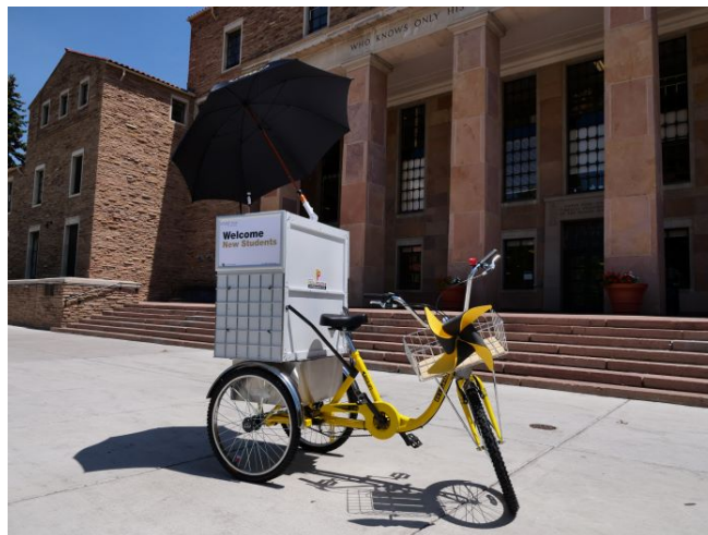
Figure 1: InfoMotion posed in front of Norlin Library at the University of Colorado Boulder.

While academic libraries strive to meaningfully engage their campus communities, it can be hard to imagine new and creative outreach strategies. InfoMotion, a customized tricycle, is the University of Colorado Boulder Libraries' "vehicle" to meet patrons where they are and embed ourselves in the campus community (Figure 1). InfoMotion was mobile and eye-catching, but it was cumbersome as we navigated campus pathways. The authors discuss their institutional context and describe an impactful partnership with engineering students to design an electric-assist system for InfoMotion. This collaboration resulted in a more user-friendly way for Libraries personnel to engage with the campus community, and helped the authors learn about student information needs while building relationships with engineering faculty and students.