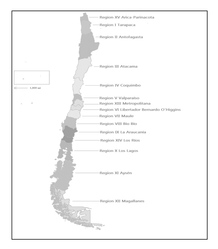
Figure A2. Chilean regions, 2009–2016 [46].