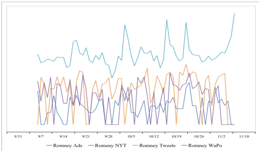
Figure 2. Daily salience for issue and attribute agendas for Romney.