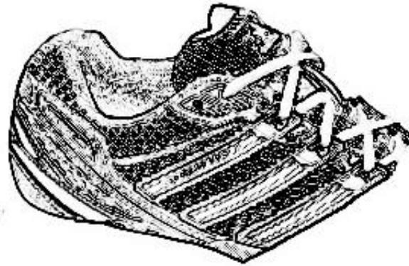
Figure 2. Sole-less half shoe and added mass attachment. A men’s running shoe with the sole and front portion of the upper removed (mass = ~150 g). For added mass trials, we attached lead weights over the foot’s center of mass using the shoe laces.