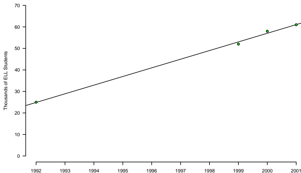
Figure 3: Growth in Number of ELL Students in Colorado

sent an undercount of Colorado's ELL students. 21