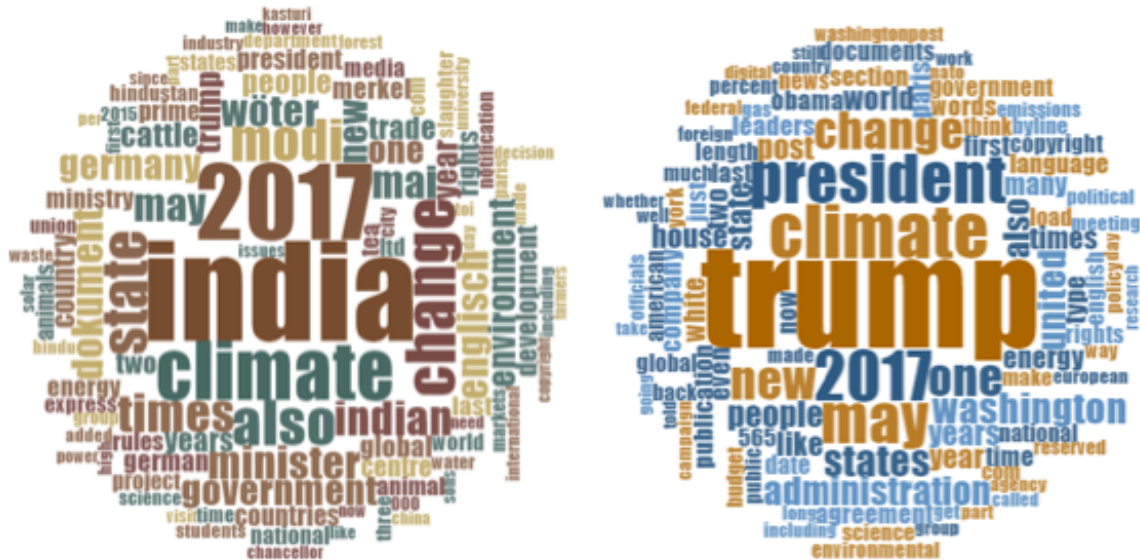
Figure 1: word frequency in climate change and global warming coverage in May 2017 from four Indian newspapers ( the Indian Express, the Hindu, the Hindustan Times, and the Times of India ) and five US sources ( the Washington Post, the Wall Street Journal, the New York Times, USA Today, and the Los Angeles Times )

Europe and North American also saw modest month-to-month increases in coverage, while the Middle East, Oceania, and South America all showed slight decreases compared to the previous month. Europe (142%), Oceania (81%), and Asia (22%) all increased coverage of climate change compared to May 2016. Overall, coverage across all sources in twenty-eight countries decreased approximately 43 percent compared to May 2016.