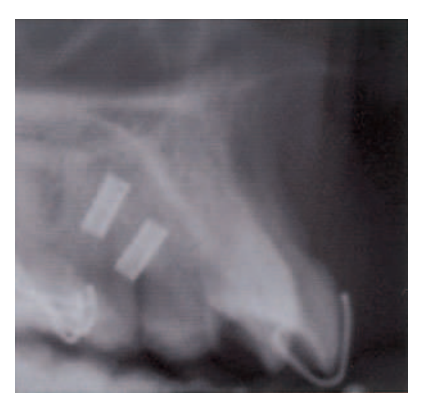
Figure 3 Resultant lateral cephalograms with the stent in position