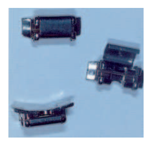
Figure 14 Ormco lingual hinge brackets