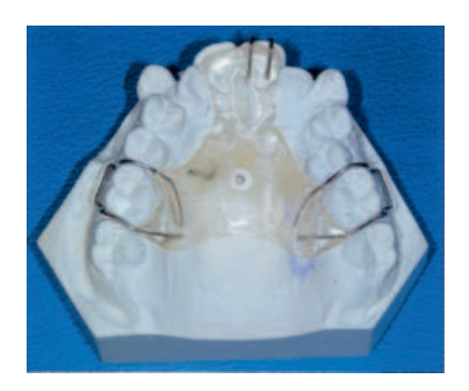
Figure 4 Conversion of radiographic stent to surgical stent