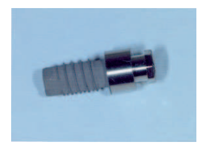
Figure 13 Straumann Ortho implant