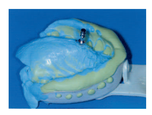
Figure 19 Ortho analogue positioned in impression prior to casting

this age. Some authors have suggested placing the implants lateral to the mid line to avoid this problem.<sup>16</sup>