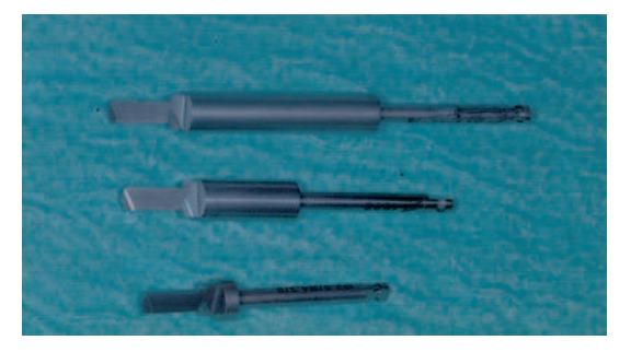
Figure 8 'Profile' drills (6 mm): 3 different shank sizes