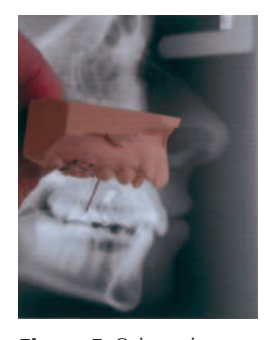
Figure 5 Orientation guide of the surgical stent