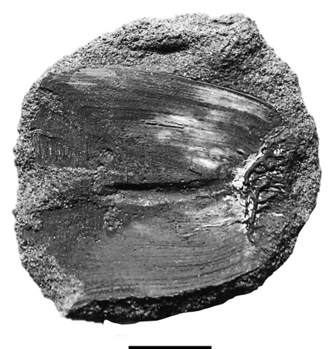
Fig. 2. Lateral line scale of Amia sp. (CMN 57523), anterior to the left, ornamented free field of scale on the right. Scale bar = 1 cm.

the body. The anterior overlapped area of the scale is extensive and thin and bears very fine subparallel ridges that subtly diverge as they pass along the surface of the scale towards the slightly deeper anterior edge.