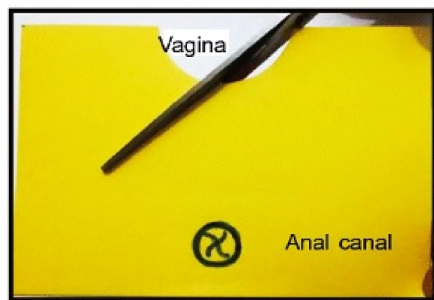
B. An episiotomy being made at 60 degrees