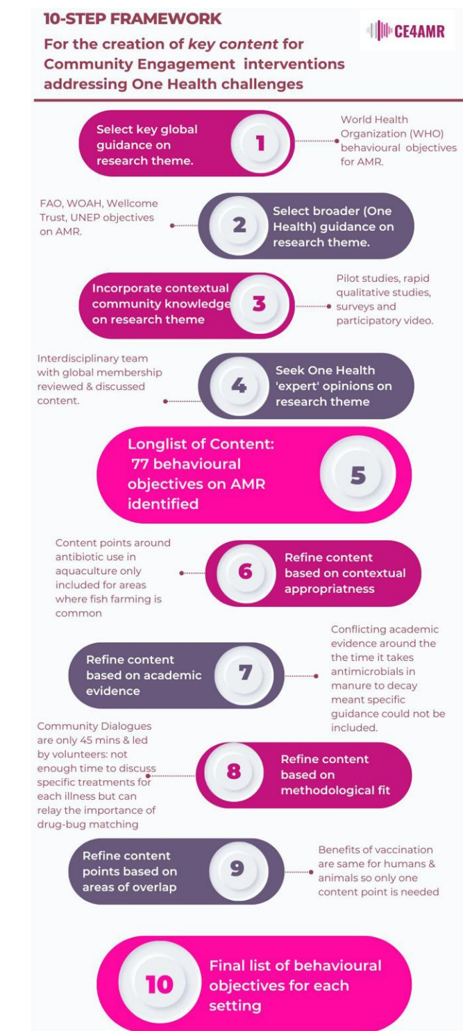
Figure 2. The 10-step framework for the selection of key content points for CE interventions that address complex One Health challenges, using the worked example of AMR.

The framework specifically helped the authorship team to balance different sources of knowledge within the content development phase. For example, AMR guidance at national and global levels frequently stipulate that one should seek advice from a qualified healthcare professional before using antimicrobial medicines, complete the course and return if they are not well again. However, in both our contexts, identifying a qualified professional, for example, is difficult due to lack of obvious credentials, such as a fixed place of work, and fraught with equity issues around access and affordability. COSTAR’s formative work showed that qualified providers such as community health care providers