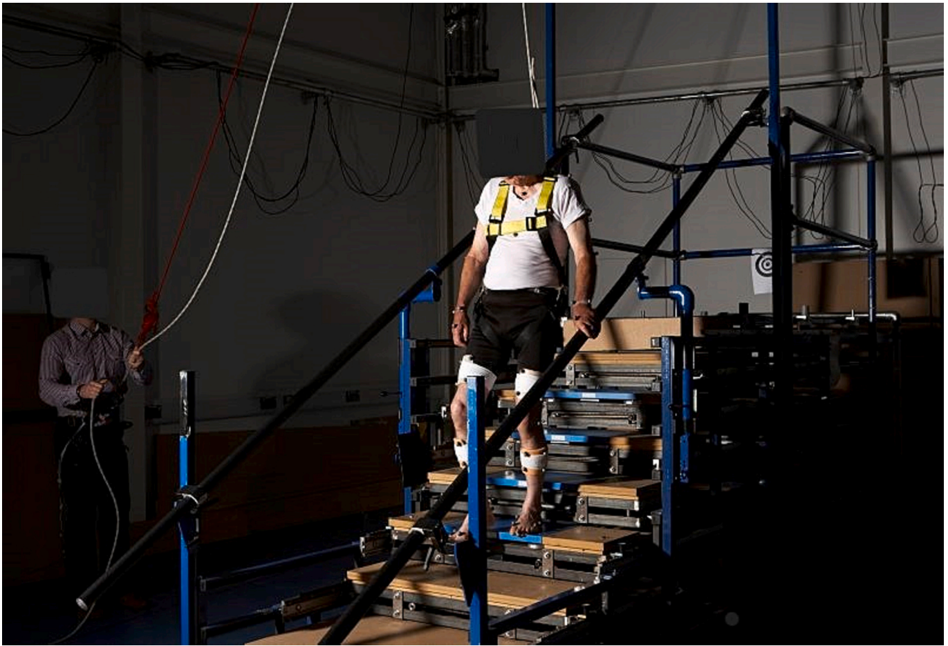
Fig. 1. The experimental set-up.

The photograph is for illustration of the experimental set-up only, no participants used the handrail during the trials.