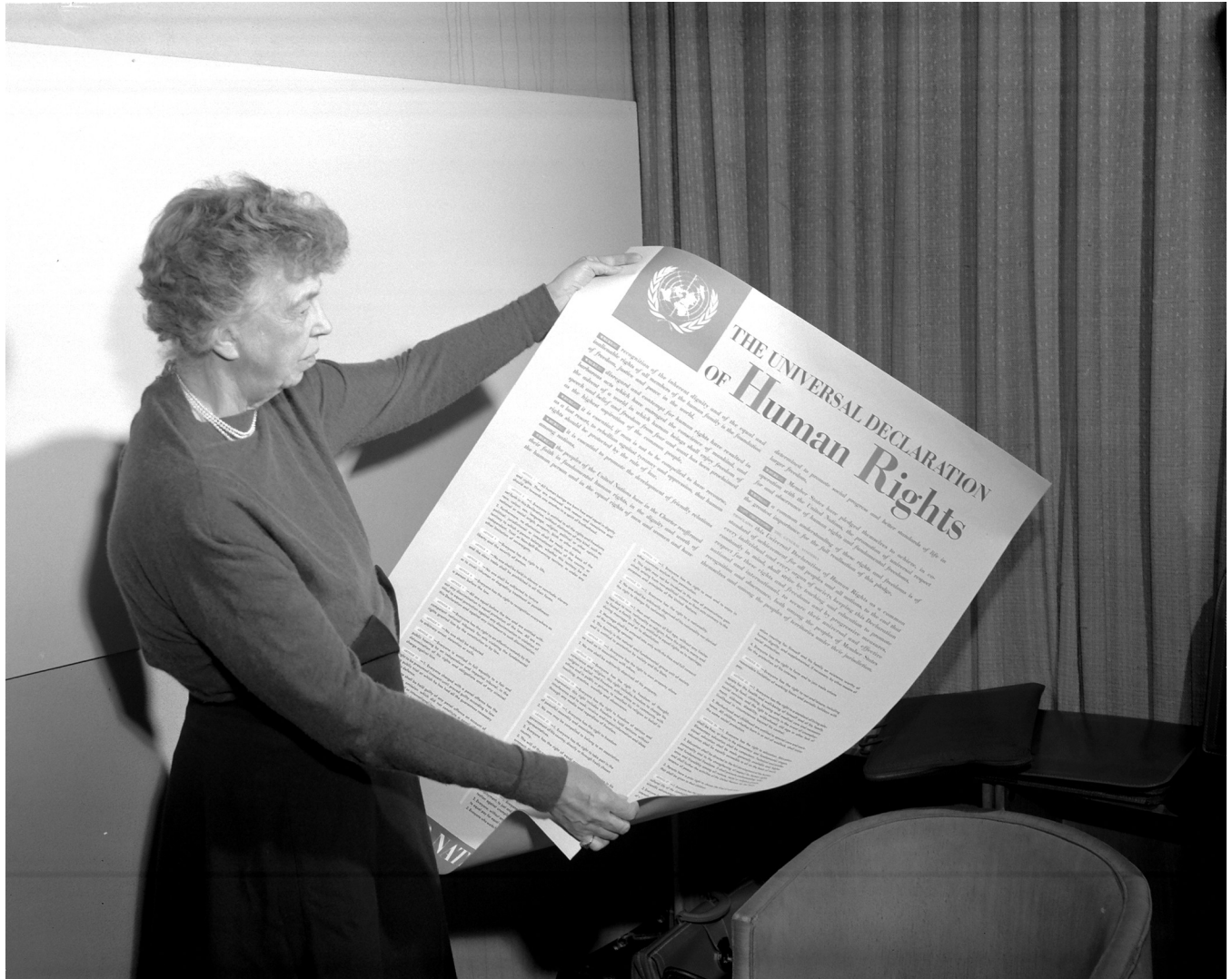
Fig 1. Commission on Human Rights Chair Eleanor Roosevelt exhibits the Universal Declaration of Human Rights (United Nations).

https://doi.org/10.1371/journal.pgph.0002663.g001