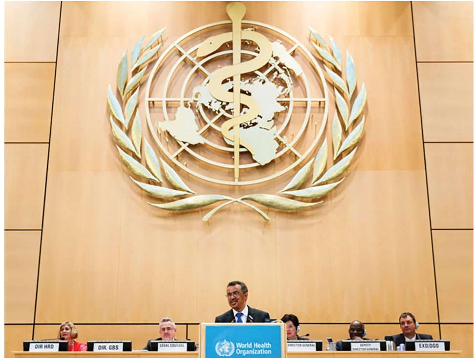
Fig 2. WHO Director-General Tedros Adhanom Ghebreyesus addresses the World Health Assembly (World Health Organization).

https://doi.org/10.1371/journal.pgph.0002663.g002