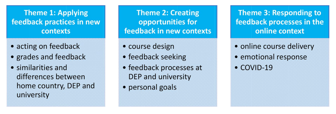
Figure 1. The consolidation of the second level codes into three themes.

via Zoom by the first author of this paper and transcribed. Although the first author of the paper was the participants' teacher for five weeks of the 20-week DEP course, at the time of the interviews the participants were no longer in a teaching relationship with the first author.