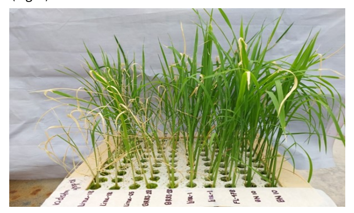
Fig 3. The phenological appearances of rice seedlings grown under \, 10dS/m salinity stress in hydroponic peter solution for one week.

Based on SPAD values, Line-1 can be categorized as salt tolerant mutant as tolerant species can protect themselves from such deterioration of Chl under salinity stress. The phenological appearance of Line-1 seedlings grown under salt stress also reflected such phenomena (Fig. 3).