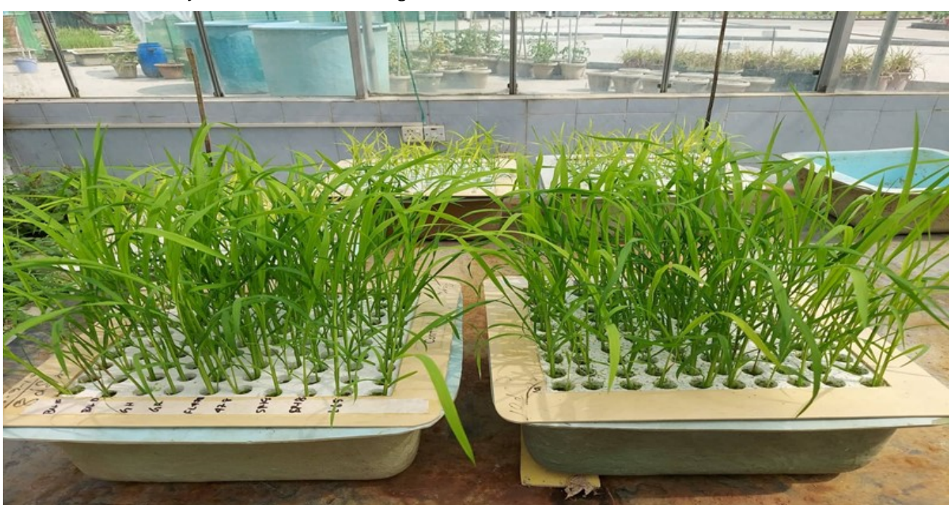
Fig 1: Partial view of the hydroponic screening of rice seedling for salt tolerance at the seedling stage.

The experiment was conducted in a large size plastic-tub (135 cm × 90 cm × 24 cm) filled with field soil. The soil of the tub was prepared by puddling the soil and mixing the recommended doses of cow dung, fertilizers (Urea, TSP, and MP). Thirty days old seedlings were transplanted in the plastic tub. Two seedlings were transplanted per hill keeping plant to plant distance of 20 cm and row to row distance of 25 cm. At the end of rice growth stage 4 (young panicle about to emerge from flag leaf), leaf clipping of each genotype was performed while leaving the flag leaf. Saline water was then irrigated for three weeks at a level of one centimetre above the soil surface. After three weeks, plants were irrigated with normal irrigation water. Data were recorded after harvesting.