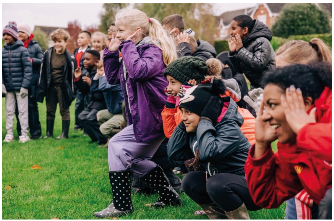
Figure 5. Learners sharing experiences at a Champion School visit

Financial support, together with advice and guidance, provided all schools within the National Forest with the supportive network they required to move toward delivery of a sustainable outdoor learning program. Despite the difficulties schools faced due to the pandemic, staff losses, and budget cuts, the CF4L project resulted in greater equity for young people to access treescapes across the Forest, regardless of background or school (Figure 5). We feel that the results of capacity-building within schools over a five-year period speak for themselves, as over two-thirds of primary schools in the National Forest (Figure 6) now provide regular outdoor learning as part of their curriculum offerings!