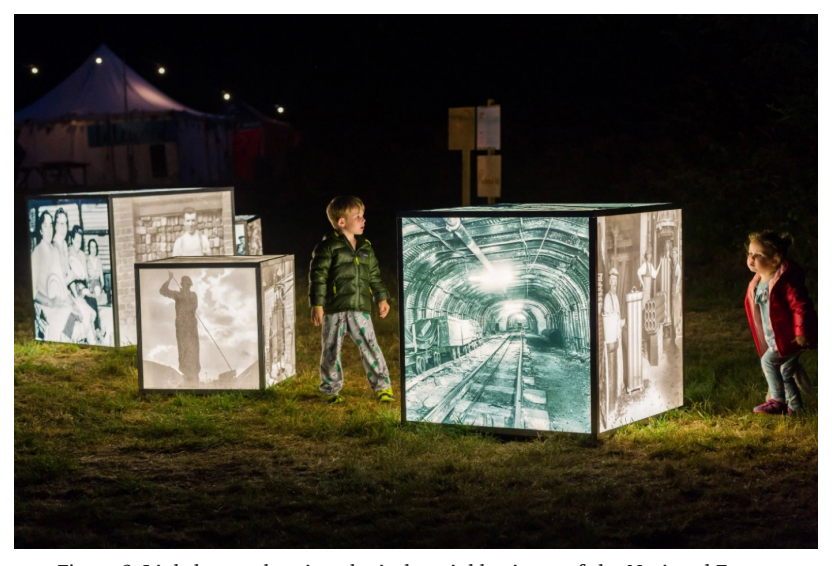
Figure 2. Lightboxes showing the industrial heritage of the National Forest

In 1995, the UK's Department for Environment, Food and Rural Affairs (Defra) decided to set up an organization aptly named the National Forest Company (NFC). It was tasked with leading the creation and subsequent development of the National Forest, keeping communities at its core. Encouragingly, the UK Countryside Commission recognized early on that the National Forest had the potential to be one of the biggest and most exciting open-air classrooms in the country (Countryside Commission, 1994) and could provide an opportunity to showcase how environmental issues interacted with each other, from the local to the national and global. Incredibly, since then over nine million trees have been planted, and it is these trees that have been the catalyst for change. To ensure that the National Forest both survived and thrived, children, young people, and environmental education were put at the heart of how the Forest was envisioned from the outset, with the aim of fostering a sense of local pride, awareness, appreciation, and ownership (Figure 2). The commitment was not only to embed the concept of a forest into the culture of the next generation, but also to connect children and young people to what would be very different surroundings from those of their predecessors. So how was this going to be achieved?