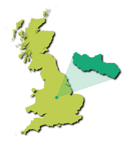
Figure 1. Map showing the location of the National Forest (dark green) within mainland Great Britain (light green)

If you don't live in or near England's National Forest, you probably have never heard of it. In the grand scheme of things, it doesn't cover a huge area, but despite its modest size, the National Forest is one of the boldest environmentally led regeneration initiatives in the United Kingdom. Over three decades ago, this 200-square-mile stretch of the Midlands in the heart of the UK (Figure 1) was postindustrial land. The impact of heavy industry, familiar to many of us across the world, left a landscape horribly scarred, black from coal and clay mining, and devoid of trees. It was hardly a children's playground.