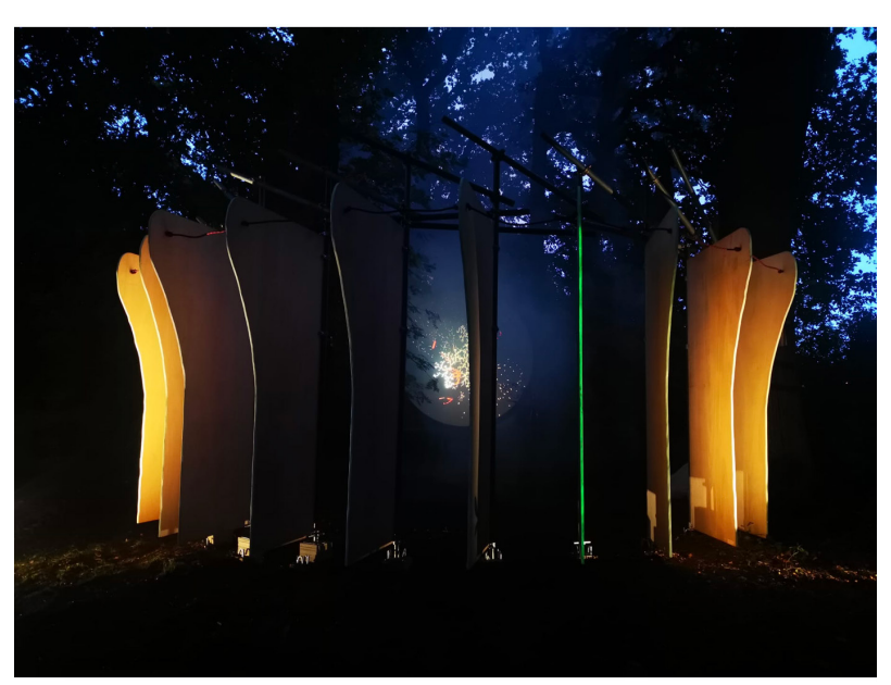
Figure 11. "The Underneath": Installation created by the Youth Landscapers Collective for Timber Festival 2022

It is these individual experiences that truly show the transformational impact that connecting young people with their local treescapes can have.