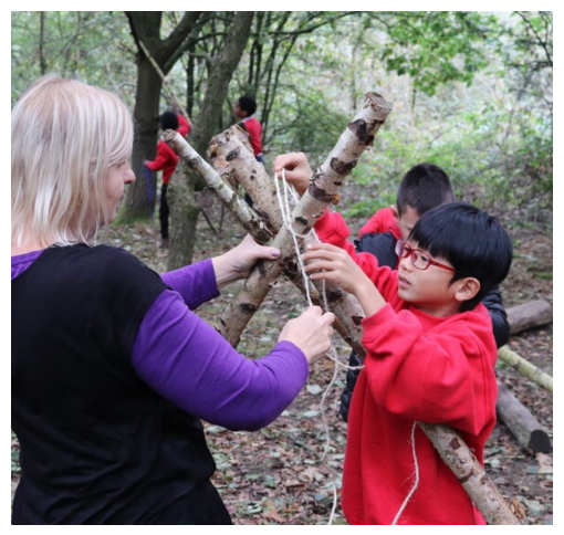
Figure 4. Building confidence through learning den-building skills