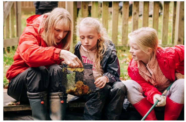
Figure 9. Staff engaging learners with nature following training facilitated by the National Forest Company

As with the CF4L project, a key element of the Forest Foxes project, alongside Forest visits, was the provision of Level 3 Forest School training for teachers. Unfortunately, just as the Forest Foxes project was launched, the COVID-19 pandemic struck. That didn't stop us. Partners were able to deliver a combination of online learning sessions and (when permitted) practical outdoor skill training in person. This meant that teachers could continue their training, developing their knowledge and experience so they were ready to deliver outdoor learning sessions once pupils returned to school. The group practical skills days delivered within treescape settings stood out as particularly successful, once again demonstrating how important it was to train teachers in appropriate spaces. One trainee felt that a skills day had "given me the confidence to talk to pupils and staff that I've never met before," illustrating the wider benefits and connections that can be made within a treescape setting (Figure 9).