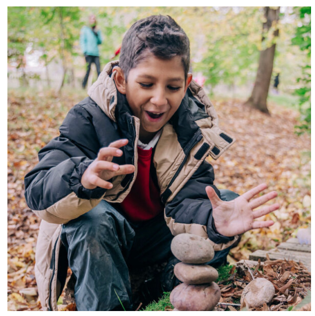
Figure 8. The satisfaction of achieving something different

As with the CF4L project, a key element of the Forest Foxes project, alongside Forest visits, was the provision of Level 3 Forest School training for teachers. Unfortunately, just as the Forest Foxes project was launched, the COVID-19 pandemic struck. That didn't stop us. Partners were able to deliver a combination of online learning sessions and (when permitted) practical outdoor skill training in person. This meant that teachers could continue their training, developing their knowledge and experience so they were ready to deliver outdoor learning sessions once pupils returned to school. The group practical skills days delivered within treescape settings stood out as particularly successful, once again demonstrating how important it was to train teachers in appropriate spaces. One trainee felt that a skills day had "given me the confidence to talk to pupils and staff that I've never met before," illustrating the wider benefits and connections that can be made within a treescape setting (Figure 9).