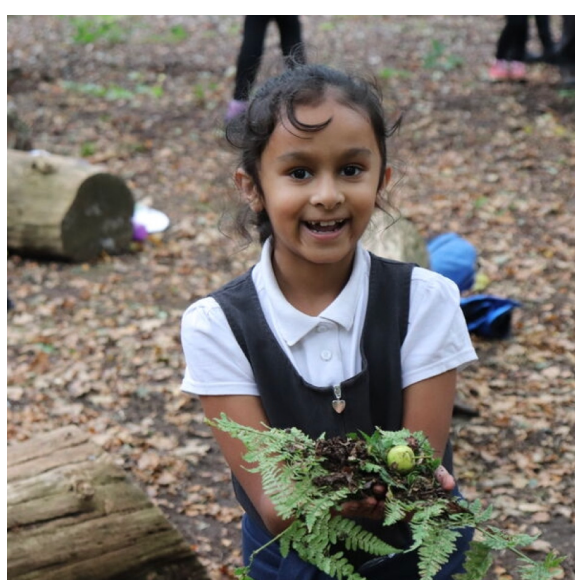
Figure 7. The joy of gathering natural resources for nature art

When children who took part were asked for feedback, their comments also showed the positive impact Forest Schools could have on them: "I love Forest School because of all the fun we have playing with nature and making new friends," said one. "[Forest School is] better than the beach," said another.