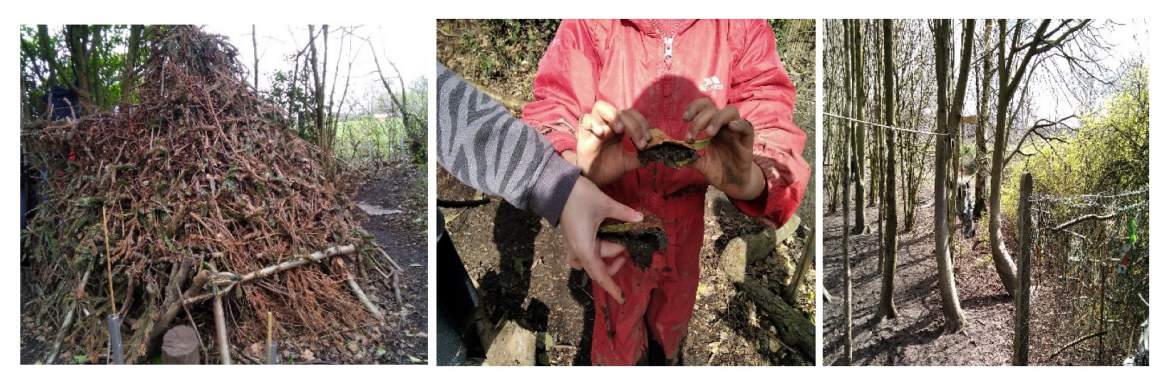
Figure 2. Children from Years 3 and 4 in the school woodland (photos taken on March 27, 2023)

At a later date (one month later) we had the ethical agreement in place and we could document the children's activities in the woodland. Children from each class went to the forest school (the woodland) once a week. During our visit one afternoon, we were accompanied by the children from one class (Year 3) to note what children do and become while they are with trees and nature in the forest school. We observed that the children learned about nature, trees, wood, and the habitats of chickens and other birds in the nearby plot of land. The children were engaged in different physical and sensual activities such as building dens, playing with mud, and hanging with the bark of trees, as shown in Figure 2.