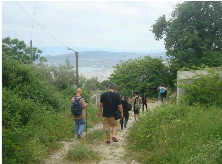
Figure 5. Heading home

Such a process highlights an image from the end of the hike, where all the refugees and prospective early childhood teachers had come together as a group (Figure 5). Everyone had learned each other's names and some details about their lives. The participants exchanged promises to organize another day-long trip along a different path among the centuries-old trees of the forest—a hike that, in addition to its environmental value, could represent a path of intercultural exchange, solidarity, and empathy.