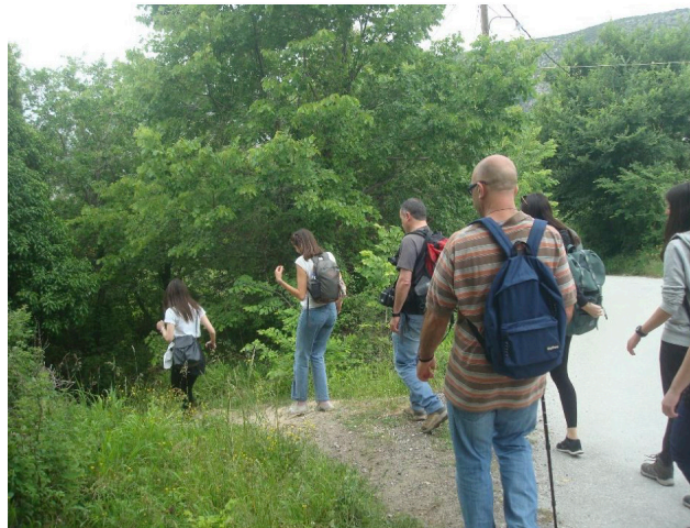
Figure 1. The path through the trees brought to mind many images from the participants' homelands

Those narratives created great interest among all the participants to get to know each other's places of origin better. The group searched for those places on the map using the internet on their mobile phones. They viewed images from their different countries and places of origin, discovering similarities and differences, and commented on what they saw. Also, with the support of the researchers who accompanied them, they discussed issues related to the natural environment in their countries of origin, the dominant tree species there, and the consequences of climate change on the growth of trees and forests.