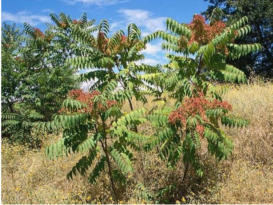
Figure 3. The “refugee tree”

During the hike, when one of the refugees in the group encountered a tree 9 that is particularly common in Pakistan, but that also has become very common Greece in recent years. He commented, “these trees are like us, they are refugee trees” (Figure 3).