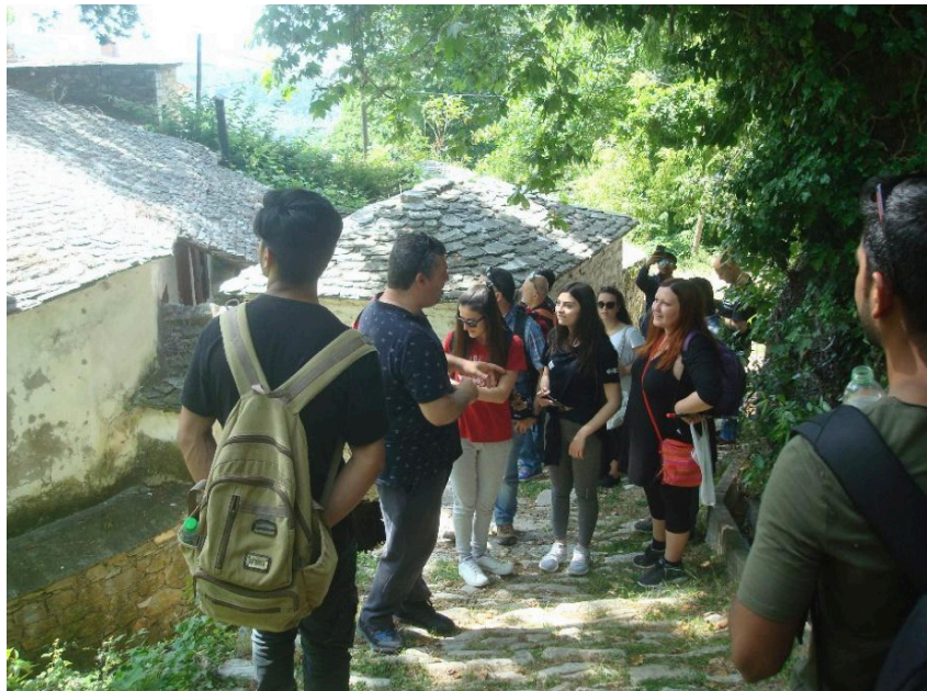
Figure 2. Discussing the trees of our childhood

Almost all the participants, regardless of their place of origin, have retained images and memories of trees from their childhood. This highlights the importance of the influence of trees, and also of the natural world in general, in the lives of children. Several of the participants spoke of a particular favorite tree with which they had developed a special relationship when they were children.