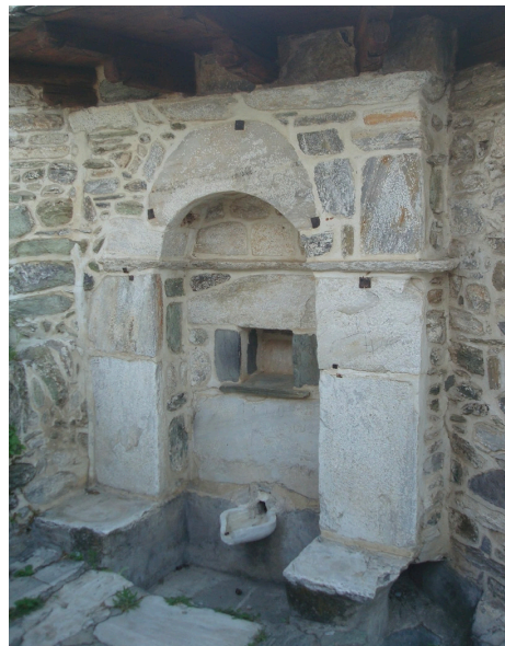
Figure 4. This fountain, which we encountered on our hike, prompted a discussion about fairies in the participants' traditions