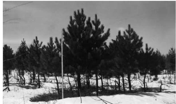
Figure 2. "The demarcation between the living foliage and dead branches of all trees in the group forms a straight horizontal line". Page 6 in Pomerleau and Ray (1957).