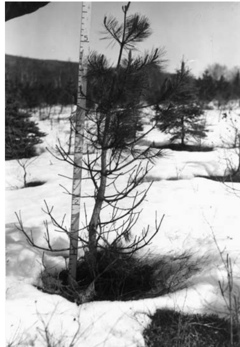
Figure 1. "All the lower branches up to three, four, or five feet on living red pine bore dead terminal shoots and later were completely defoliated". Page 5 in Pomerleau and Ray (1957).

We compiled recorded frost damage by categories such as late or spring frost and early or fall frost, as well as by tree species. We examined all records from the provinces of Ontario, Quebec, the Maritimes and Newfoundland included in the Annual Reports of the