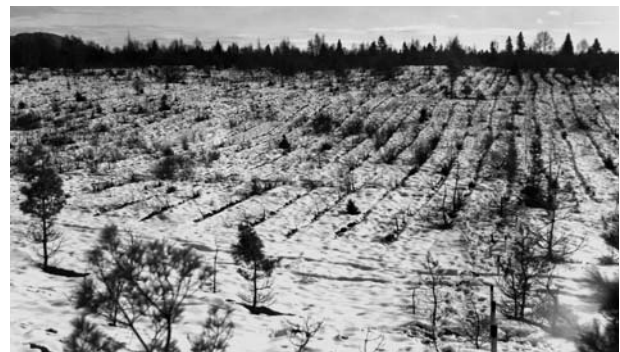
Figure 3. "In a few areas, especially in ground depressions, all the red pine trees were dead." Page 6 in Pomerleau and Ray (1957).