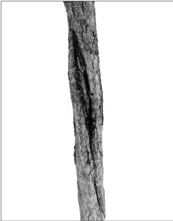
Figure 4. Canker sample on residual red pine planted in 1934 and located at the Valcartier plantation studied by Pomerleau and Ray (1957).