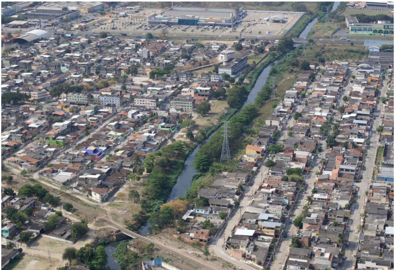
Photo 2 – Botas River, Belford Roxo, before intervention. Panoramic view