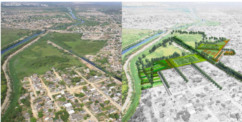
Fig.2 – Opportunities of intervention. Remaining open spaces along the rivers. Sarapuí River