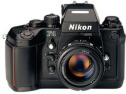
Figure 2 – Nikon F4 (manufactured from 1988 to 1996)

What we know for certain is that Nikon engineers probably noticed that the F4's large grip made it difficult to shoot in vertical position. As a result it was replaced by the F5's thinner and less "aggressive" gear (fig. 3). But there is more: the F5 also has a new shooting button in the bottom part of the camera that comes exactly under the photographer's finger when he holds the camera in vertical position. I would not be surprised, therefore, to discover that F5 users are more drawn to vertical shots than other photographers. I'm not thinking about some kind of conditioning: the new button simply makes a given action easier to perform. Where there was an obstacle now there is an invitation that sooner or later will be accepted, making people better acquainted with this "aesthetic". In other words, the interface simply creates a tension (or inclination) towards a way of shooting which then becomes more likely.