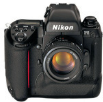
Figure 3 – Nikon F5 (manufactured from 1996 to 2004)

What we know for certain is that Nikon engineers probably noticed that the F4's large grip made it difficult to shoot in vertical position. As a result it was replaced by the F5's thinner and less "aggressive" gear (fig. 3). But there is more: the F5 also has a new shooting button in the bottom part of the camera that comes exactly under the photographer's finger when he holds the camera in vertical position. I would not be surprised, therefore, to discover that F5 users are more drawn to vertical shots than other photographers. I'm not thinking about some kind of conditioning: the new button simply makes a given action easier to perform. Where there was an obstacle now there is an invitation that sooner or later will be accepted, making people better acquainted with this "aesthetic". In other words, the interface simply creates a tension (or inclination) towards a way of shooting which then becomes more likely.