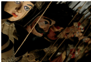
Figure 10 – An example of an off-centre focus

Previously, when the right focus had to be found manually, the photographer had to “search” for it. With SLR cameras, the Operator usually began by framing the scene and only then moved the focus ring on the lens until the image in the viewfinder became perfectly sharp. Since focusing was obtained in a progressive way, effects like the one seen in figure 10 might be obtained by chance. When you move the ring, in fact, the focus “passes over” different zones in the image before getting in the “right” place, which usually lies at the centre of the image 5 . In some instances an off-centre focus may make visible a subject that we didn't initially conceived of as being the primary one in the picture; and yet we “discover” that this non-conventional composition is more “interesting” than the classical one we had intended.