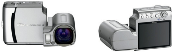
Figure 4 - Coolpix S4 (manufactured from 2005)

From a semiotic point of view, what changes concerns what Landowsky (1989) calls the “viewing regimes” of Operator and Spectrum : not only can the Operator easily hide when shooting but also, from the point of view of the Spectrum , many new modalities of “appearing” and engaging with the Operator become possible. But there is more. The new modalities of interaction also affect the particular “detachment” that the Operator usually experiences when looking through the viewfinder. Julio Cortàzar depicts perfectly this moment in which a piece of reality becomes a flat image in his short story Las babas del Diablo . He writes: