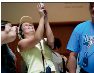
Figure 8 - Social picture

possibilities that the space offers as well as those offered by their camera. This becomes the perfect moment to “test that special effect that we never tried before” or to push that mysterious button we never had the time to push. With the opportunities for picture-taking all concentrated in the single location and with the limited field offered by the subject, technique becomes the only way out of an otherwise frustrating situation (fig. 8).