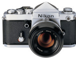
Figure 1 – Nikon F2 (manufactured from 1971 to 1980)

The influence of ergonomics becomes clear when looking at cameras’ bodies, and in particular at grips and at controls (including their shape and position). A few years have been enough to change the grip of the Nikon professional line of cameras, the F-series, from the one represented in figure 1 to the one seen in figure 2. The second one is definitely bigger and its shape should make it easier to be grasped by the Operator. This is what should happen in theory, but in practice the inverse effect is equally produced: the camera now firmly “grabs” the Operator’s hand which is forced to follow the contour of the “imprint” of a hand on which the grip is shaped (Fontanille 2004), a generic hand whose owner nobody knows. Therefore, the grip cannot be considered passive, on the contrary it seems to structure the way in which the Operator holds the camera and, as a result, the way in which he will frame the Spectrum . The hand’s position also affects the ease with which controls can be reached and the frequency of their activation. Thus the question that arises is how much the camera contributes to the Operator’s decisions, and in particular: does this perfectly adapted grip encourage certain shooting positions over other positions?