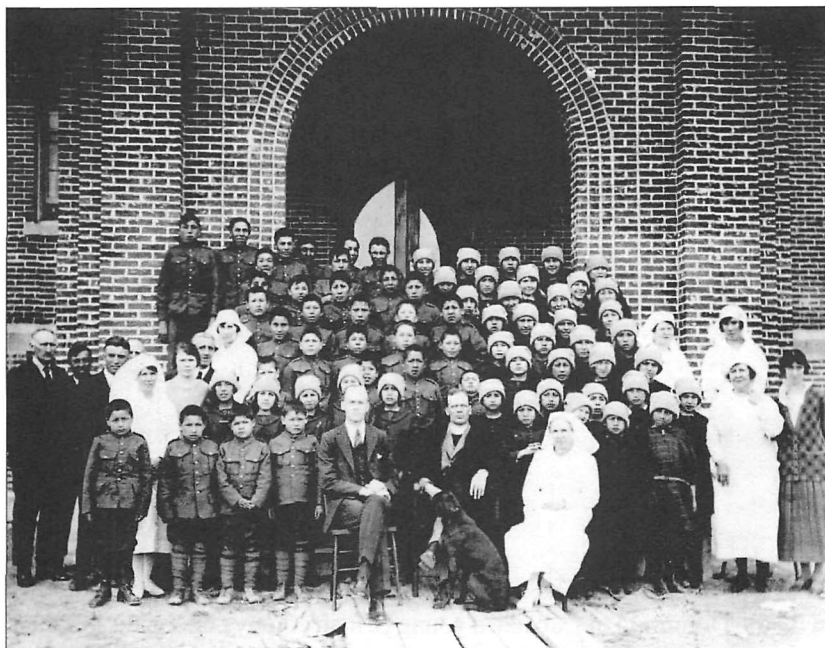
Figure 3. Pupils and staff, St. Paul's School, Blood Reserve, 1924.

sustained them and gave them identity as Niitsitapiiksi . Throughout all of this, consciousness of Blackfoot territory became colonized: the “rez” became the homeland, while Náápiikoiksi occupied all of the remaining kitáóowahsinnoon .