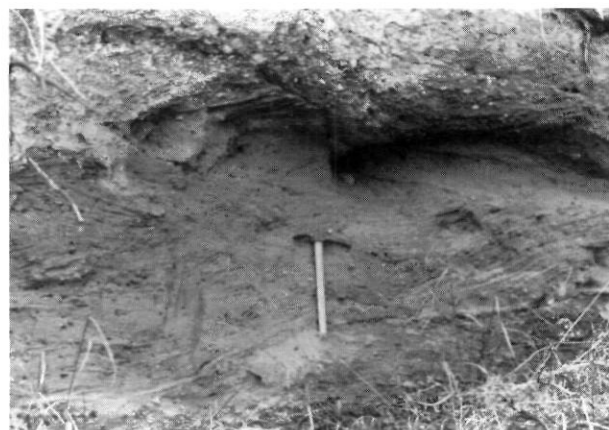
FIGURE 2. Lowest unit of cross-bedded channel sand and gravel at Cordova Bay (pick is 43 cm long).

Five pollen zones are recognized within the organic-rich floodplain unit of the Muir Point Formation (Fig. 5) and represent mainly changes in edaphic conditions resulting from tidal river meander shifts (Alley and Hicock, 1986). Zone 1, based on one sample of peaty sand, is characterized by Douglas fir ( Pseudotsuga menziesii ). Zone 2 (peaty silt) is dominated by grass (Gramineae), Douglas fir, and western red cedar ( Thuja plicata ) which imply grassy floodplain near the upstream end of a tidal channel or flat (as indicated by rare marine dinoflagellate cysts). Douglas fir and cedar probably grew on adjacent uplands and in stands scattered across the floodplain. This is followed by zone 3 (organic-rich silt) of mainly alder ( Alnus ), cedar, Douglas fir, and grass representing a shift of the estuarine channel and the establishment of a swampy floodplain ecosystem. Douglas fir, cedar, western hemlock ( Tsuga heterophylla ), alder, maple ( Acer ), and aquatic plants characterize zone 4 (autochthonous peat) which represents a swamp that formed on the floodplain.