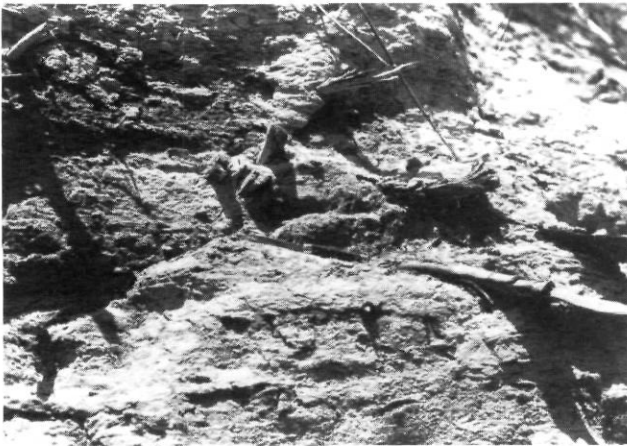
FIGURE 3. Macrofossils in interbedded organic-rich silt, sand and gravel of the floodplain unit at Muir Point (knife is 20 cm long).

Macrofossiles dans le silt, sable et gravier interstratifié riche en matière organique de l'unité de plaine d'inondation à Muir Point (le couteau mesure 20 cm).