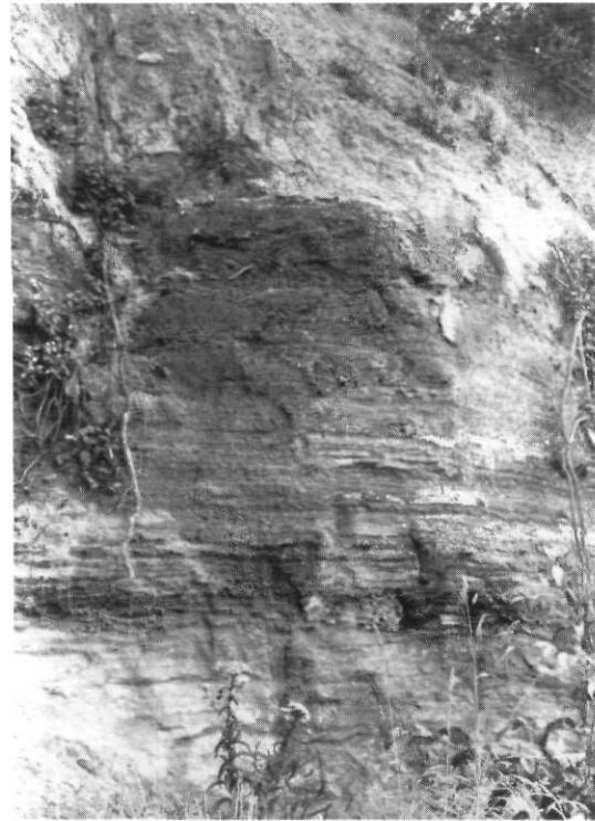
FIGURE 4. Compact, fissile autochthonous peat of a floodplain swamp (layered dark material in middle) between interlayered organic-rich floodplain silt and sand (below), and mixed alluvial fan gravel and debris flow diamicton (lighter sediment, above) at Muir Point (knife at centre is 20 cm long).

Macrofossiles dans le silt, sable et gravier interstratifié riche en matière organique de l'unité de plaine d'inondation à Muir Point (le couteau mesure 20 cm).