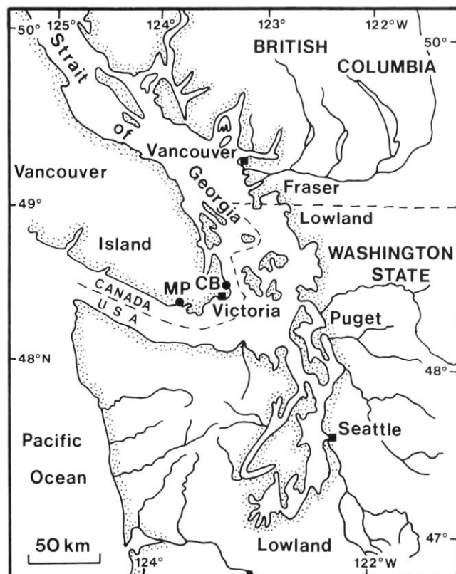
FIGURE 1. Location map showing southwest British Columbia and northwest Washington State. MP: holostratotype at Muir Point; CB: parastratotype at Cordova Bay.

The Muir Point Formation is sandwiched unconformably between glacial formations and contains five units with conformable contacts between them (Hicock and Armstrong, 1983; Alley and Hicock, 1986). At the base is cross-bedded deltaic and (or) channel rusty gravel (Fig. 2) containing lenses of