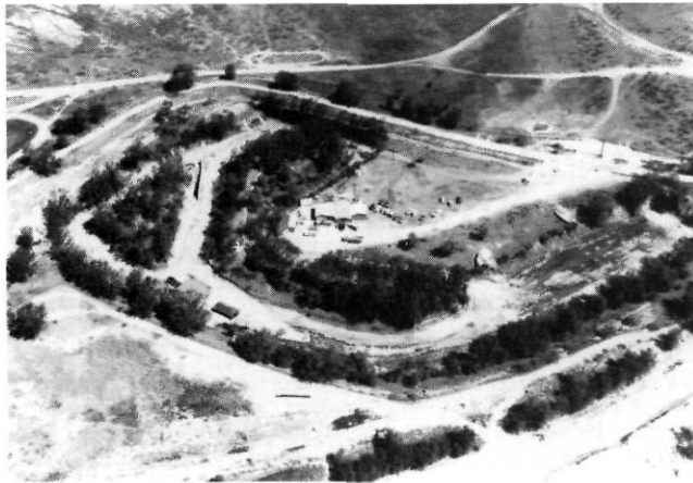
FIGURE 2. Aerial view of the basin section of the Lubbock Lake Landmark showing a large meander and the walls of the draw.

Vue aérienne du bassin lacustre de Lubbock Lake qui montre un large méandre et les murs du couloir de drainage.