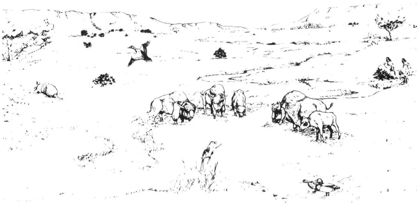
FIGURE 4. Artist's drawing of the paleoenvironns and fauna of the Southern High Plains draws during Folsom through Plainview times (11,000-10,000 yr BP).

≠ extinct + no longer occurring in the region