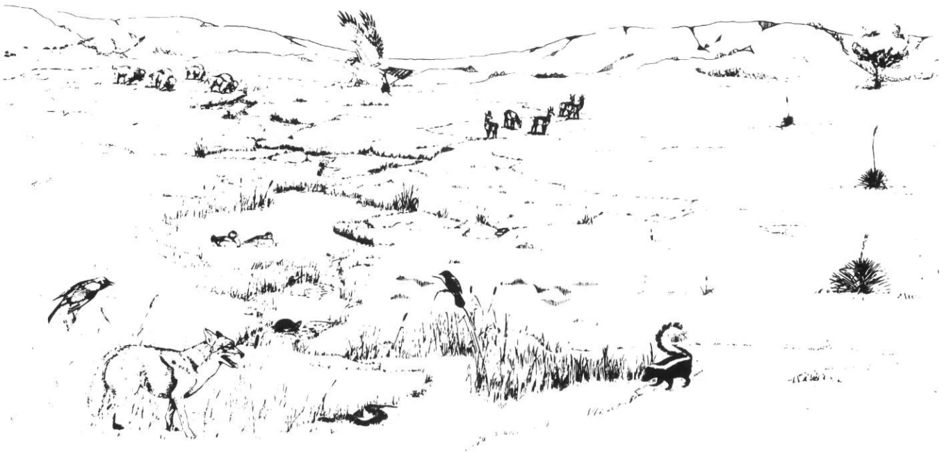
FIGURE 5. Artist's drawing of the paleoenvironments and fauna of the Southern High Plains draws during Firstview times (8600 yr BP).

Dessin du paléomilieu et de la faune qui existaient à l'époque de Firstview (8600 BP) dans les hautes plaines du Sud.