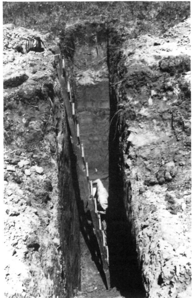
FIGURE 3. Upper four meters of sediments in First Meadow. Les quatre premiers mètres de sédiments, First Meadow.

Massive arcuate moraines completely blocked Mountain Boy Valley and the Middle Fork of Bruce Canyon (Fig. 2). These moraines contain large quartzite boulders, perhaps accounting for their greater resistance to erosion and breaching. Fine-grained, boulder-free, sediments were trapped behind the Pinedale-equivalent Bruce Canyon moraine to a minimum explored depth of 107 cm (Fig. 2). Studies of these sediments and efforts to determine maximum depth of deposition are continuing. Preliminary results suggest the presence of a carbonate-rich paleosol at a depth of about 80 cm, possibly resulting from warmer and/or drier conditions in the mid-Holocene.