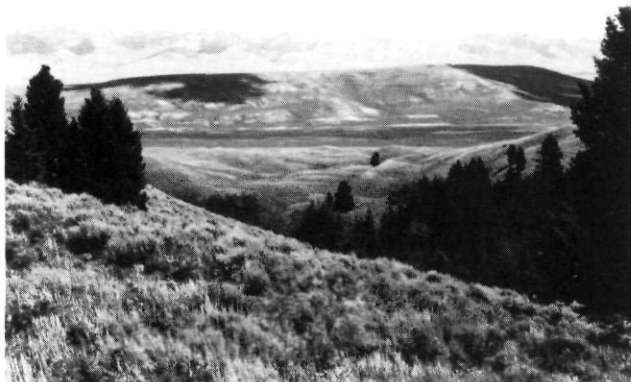
FIGURE 4. Typical Pinedale-equivalent terminal/recessional moraine complex, Deer Creek Canyon.

Complexe morainique frontal et de récession caractéristique d'épisodes corrélatifs au Pinedale, Deer Creek Canyon.