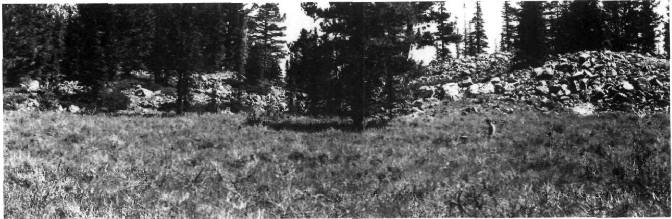
FIGURE 2. Middle Fork, Bruce Canyon Meadow. View is down-valley to the Pinedale-equivalent morainal dam. Person in soil pit provides scale.