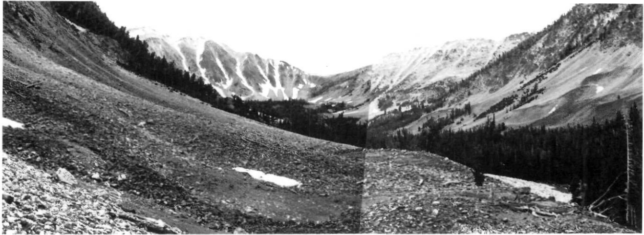
FIGURE 5. Late Neoglacial avalanche boulder tongue in Deer Creek Canyon, overriding Indian Basin protalus rampart. Note extensively-trimmed conifer on far right, indicative of occasional, modern, high-magnitude snow avalanches.

Langues de pierres du Néoglaciale supérieur, Deer Creek Canyon, chevauchant le bourrelet de congère d'Indian Basin. À remarquer, à l'extrême droite, le conifère dégarni, témoin des importantes avalanches qui surviennent à l'occasion.