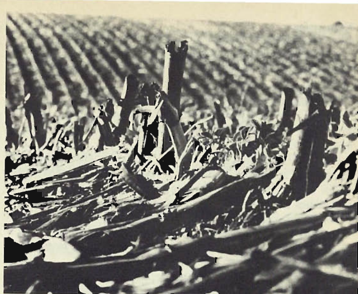
The two outstanding biological events of the 1980s—environmentalism and molecular biology—complement each other.

not plant or animal generation time. Consequently, it seemed obvious that molecular genetics not only could produce powerful new genetic improvements; it also could make the improvements in incredibly short times.