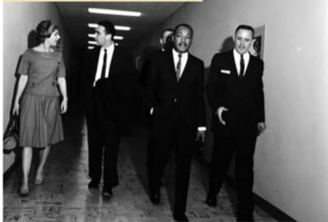
Top: Daily Texan Front Page, March 11th, 1962; Bottom: Photo from MLK's visit to UT Austin

THE INSTITUTE FOR HISTORICAL STUDIES PRESENTS