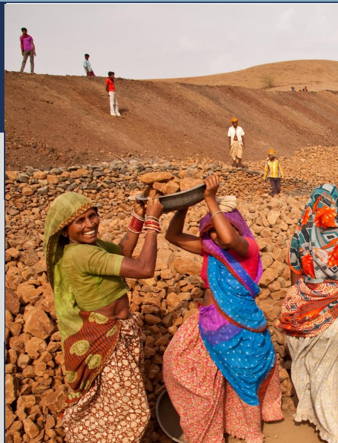
Caption: Women building a pond to assist in farming and water storage in Madhya Pradesh

INITIATIVE ON National Policies and Strategies