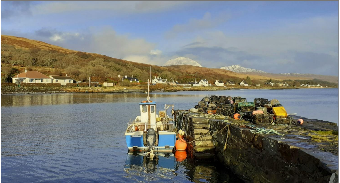
Fishing boat at the wee pier, Jura. K Gow