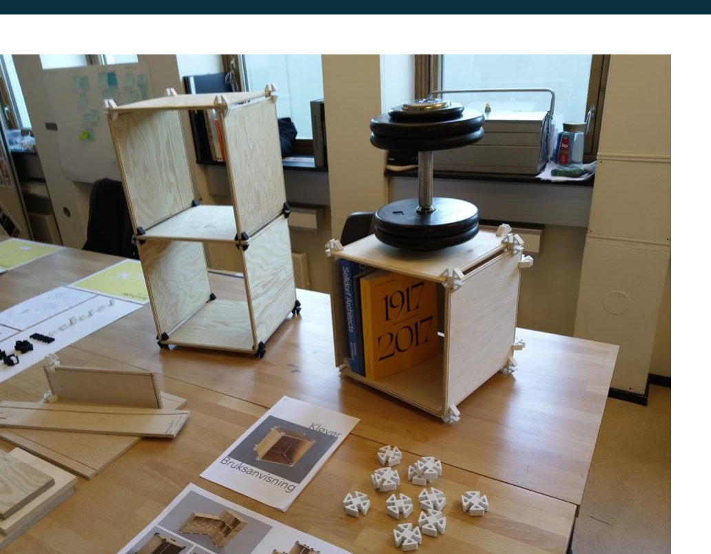
Fig. 4. Modular shelf system made by a group of six first-year students in two weeks.