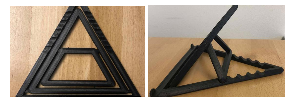
Fig.3: Example of a two week assignment inspired by affordances and dissaffordances of 3D printers: holder for tablet -flat packed design is fast to print and without support material, while being easy to store and transport.

Students also showed more agency in overcoming 3D printer dissaffordances when adopting this prototyping technique (figure 3). For example, challenges with delayed haptic feedback were repeated in seven of the projects. The learners described this as having to adjust and reprint their artefacts to get the right proportions. Another topic that emerged involved modifying and reproducing digital files on 3D printers with different mechanical material properties.