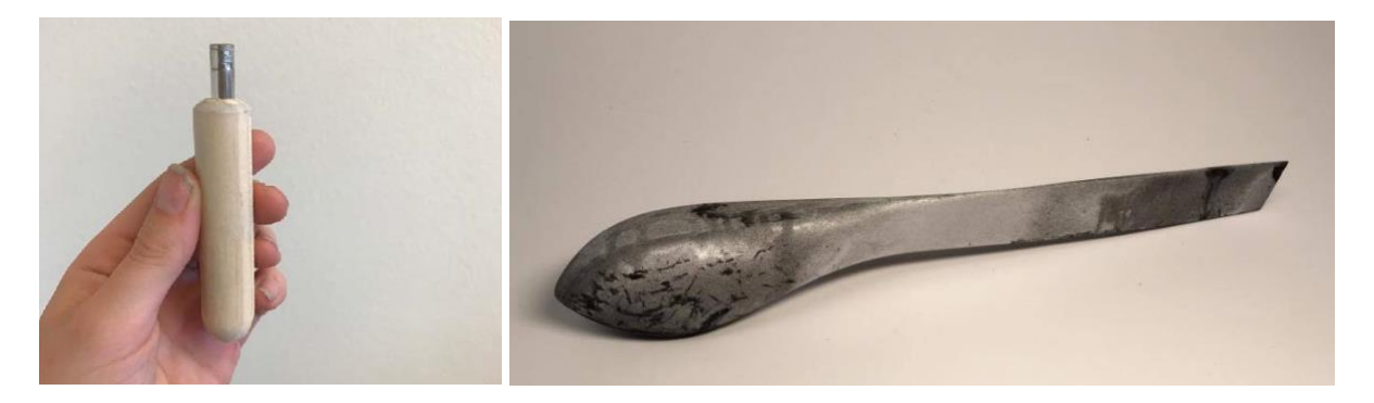
Fig. 1: Starting from the problematic situation and defining preferences, students use the media and materials they are already familiar with, such as wood and metal to answer the assignment. On the image left, preference is gender neutrality, on the picture right is aesthetic congruency.

The overwhelming majority of the 28 students were reluctant to make prototypes. The process took two tutoring sessions and two weeks, during which the students discussed their ideas among themselves, often over rough sketches. Once they started building prototypes, they used techniques learned from the previous courses (See Figure 1). Only four of the students 3D printed their prototypes.