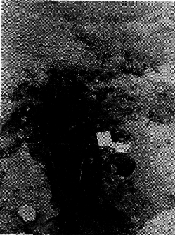
The site of till fabric analysis 3 at Redmond near Gemini Lake.

recently revived (Harrison, 1957b). By either theory, it is a necessary condition that the ice should have been moving only very slowly or not at all for the development of a fabric lacking orientation.