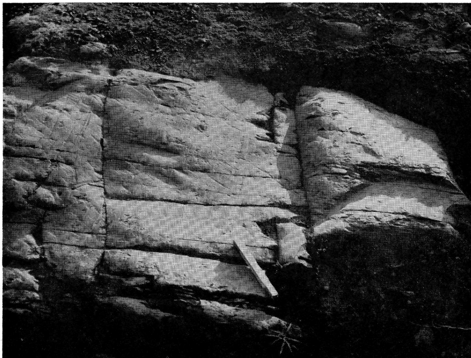
Two contrasting sets of striations at Maryjo Lake near Schefferville. The rule is aligned north-south.

ft.) in the southeast, and the Otish Mountains (3,700 ft.); there is no field evidence for flow of ice downslope from any of these areas (Ives, 1957; Wheeler, 1958; Løken, 1960). Concerning ice thickness, the area of greatest snow accumulation at the present day is along or just south of the Laurentian Scarp (Barry, 1959) and if this were so at the time of glaciation, then the ice might be expected to have been thickest and outflow greatest from this area just to the north of the St. Lawrence River (Bird, 1959). But again, there is no sign of outflow from here; and if there were outflow from any of the areas mentioned at any