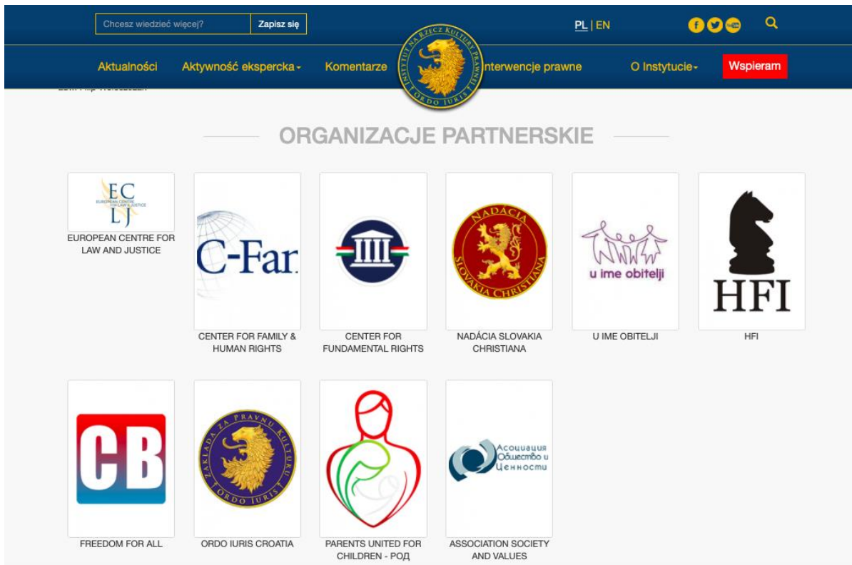
Figure 1: Ordo Iuris website screenshot, accessed 25 February 2023

abortion in Poland was vastly limited. They used all their resources in this case. By acting in the committee “Stop Abortion,” they prepared the ground for other actions. Proceeding with this project opened a Pandora's box and activated debates. This led to the political interests of some groups. Despite the project not being accepted by parliament, its appearance let other forces put pressure on right-wing MPs, strengthened by voices in the Catholic Church, pushing to limit abortion and supporting all the actions against abortion, and playing with their support, which could influence the election results. The previous constitutional abortion limitation and political environment, including the participation in culture wars and disruption of the tripartite division of power (court-packing or general prosecutor status), provided the perfect ground for such actions. The crucial puzzle in this mobilization was also the influence of the external network of right-wing organizations.