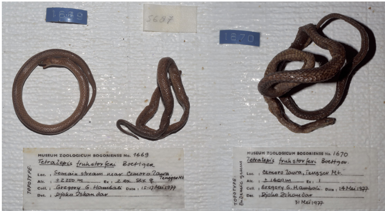
Fig. 2. Tetralepis fruhstorferi housed in Museum Zoologicum Bogoriense (MZB) – BRIN, Bogor, Indonesia. Note that MZB.1669 with Field No. 5687 corresponds to two female specimens (left and middle).