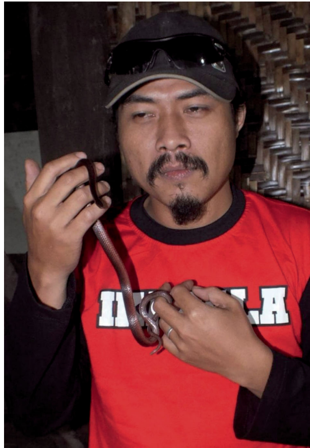
Fig. 4. A resident displaying Tetralepis fruhstorferi caught from the area of Ranu Pani Lake, Bromo Tengger Semeru mountain, recorded in 2013 (rainy season).