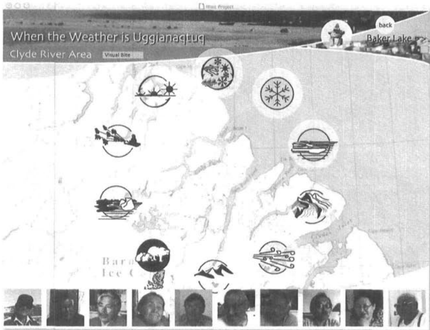
Figure 1. Main navigation page for Clyde River on the Uggianaqtuq CD-ROM. Users can navigate by person (bottom: represented by their photo, hovering with the mouse enlarges the photos and shows their name) or by topic (represented by the different symbols in the circle, the topic name appears when moused-over). The background is a map of the Clyde River area.