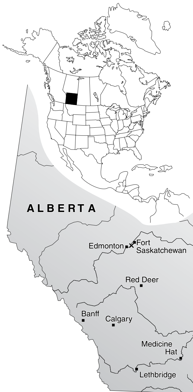
FIGURE 2. Location (X) of Bootherium bombifrons between Edmonton and Fort Saskatchewan.

Site d'origine du spécimen de Bootherium bombifrons (indiqué par un X), entre Edmonton et Fort Saskatchewan.