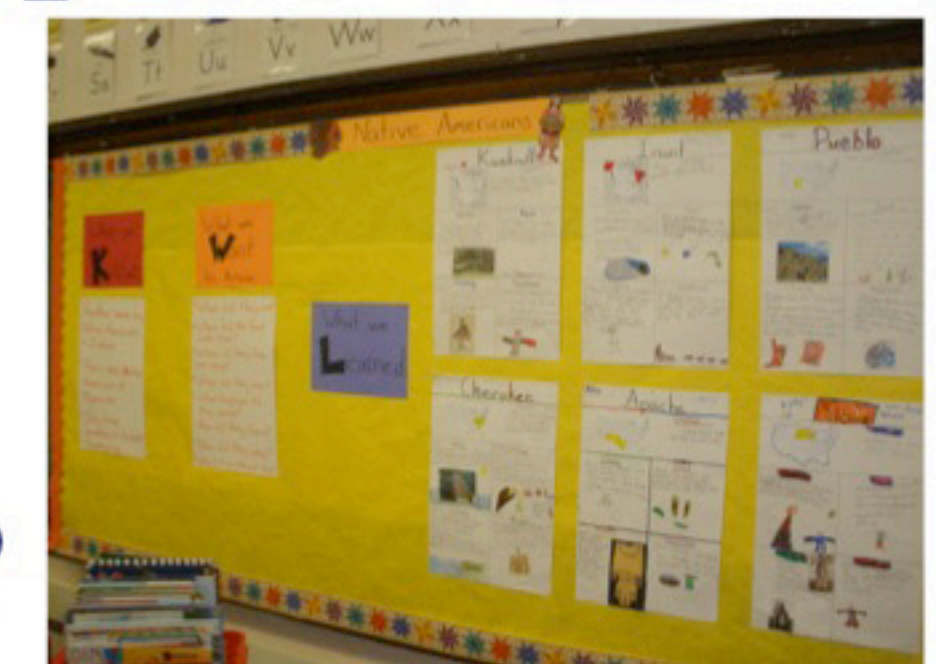
Figure 4: Social Studies projects completed in mixed-grade groups