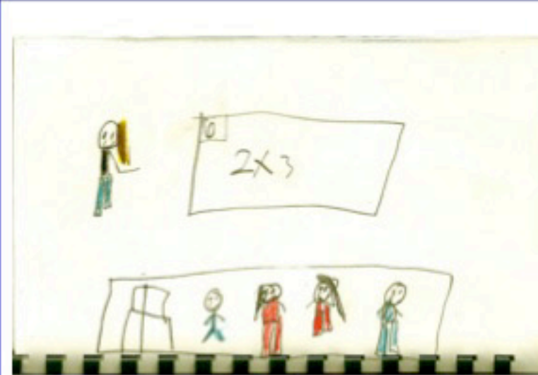
Figure 3: 1 st grade student representation of the morning meeting