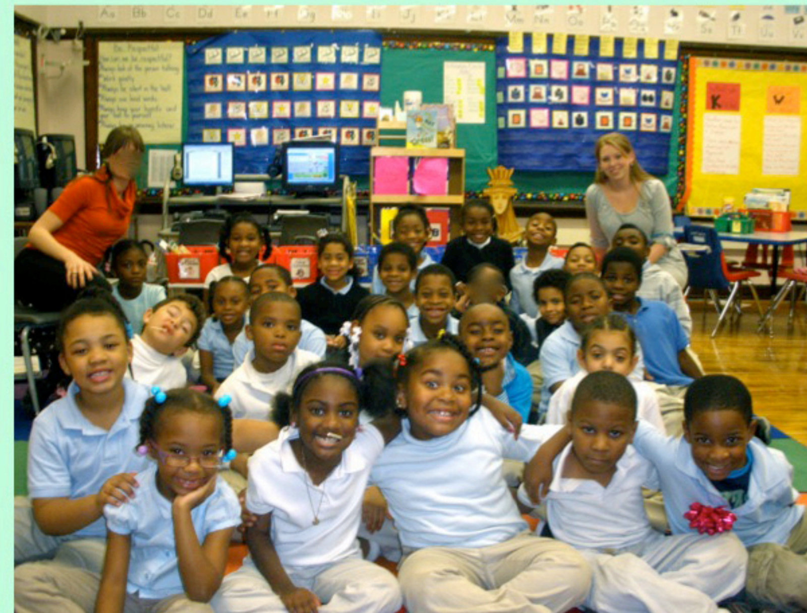
Figure 1: My 1 st & 2 nd grade multi-age class

Multi-Age: Includes students of a greater age range than is typically found in a single grade and is heterogeneous in regards to achievement or ability level.