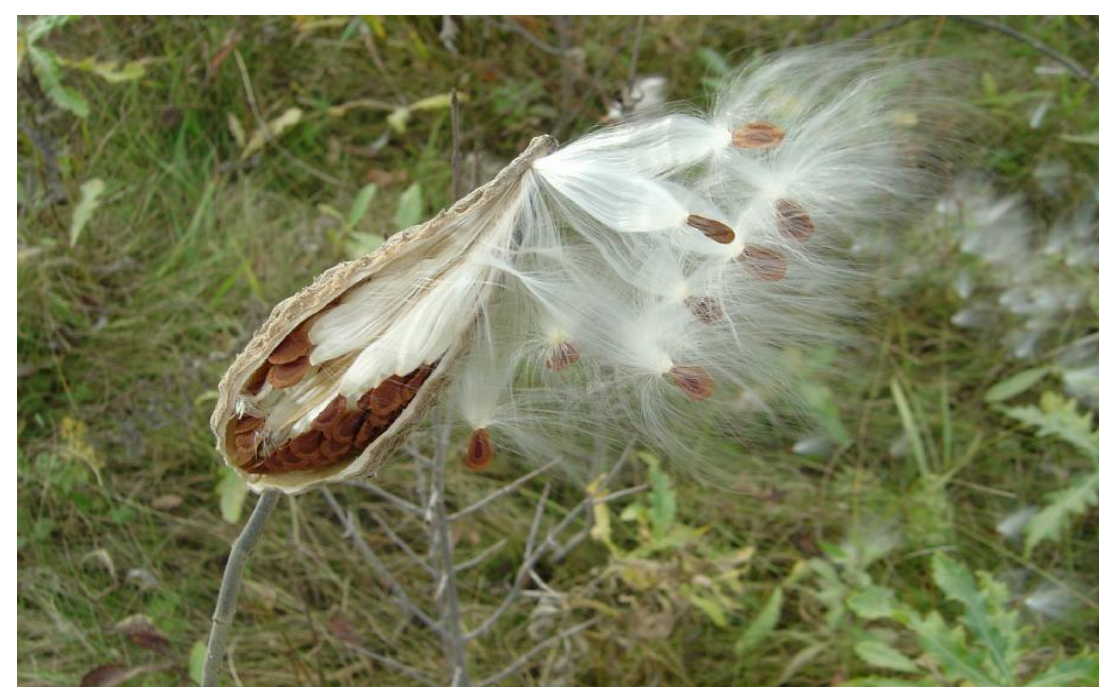
Fig. 1 http://www.learner.org/north/images/graphics/monarch/milkweed_0003.jpg

Sullivant's Milkweed ( Asclepias sullivantii ) and Common Milkweed ( Asclepias syriaca ) are native dicot forbs that are found in Illinois prairies. Their seeds typically reach maturity in Illinois in August (Penskar and Higman, 2000 and Stevens, 2006). The fruits of the Asclepias species consist of a single follicle that, when the seeds are mature, bursts open and allows the seeds to disperse (Fig 1). The coma, which is the silk-like ballooning material that is attached to the seeds (Fig. 1), aids in wind dispersal (Sacchi, 1987).