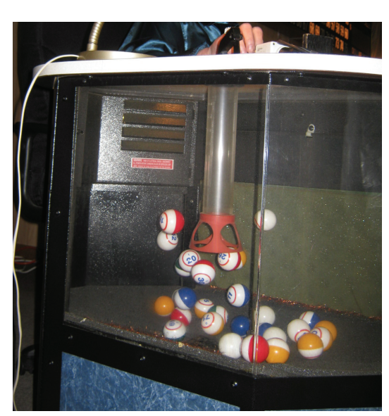
THE GAME BEGINS AS THE FIRST BALL IS EXTRACTED FROM THE HOPPER.

So when I was presented with the task of selecting a group to study for an ethnographic photo essay, I thought back to my trips to the Bingo hall. thought about my mother's obsession with getting to the hall early enough, I thought about her need to play every Sunday. I also thought about those funny little troll dolls I used to see on Bingo the tables Something is bringing these people together week after week and I wanted to find out what that is.