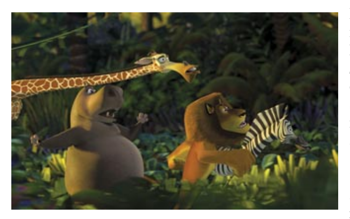
Animals who escape a zoo to return to the wild are characters in DreamWorks' newest animated film, Madagascar.

Shark Tale was one in a number of the projects on Damaschke's plate when work started in the spring of 2001. "As we moved into production on this particular film, it just made sense organically for me to stay on it and to be the producer," he says.