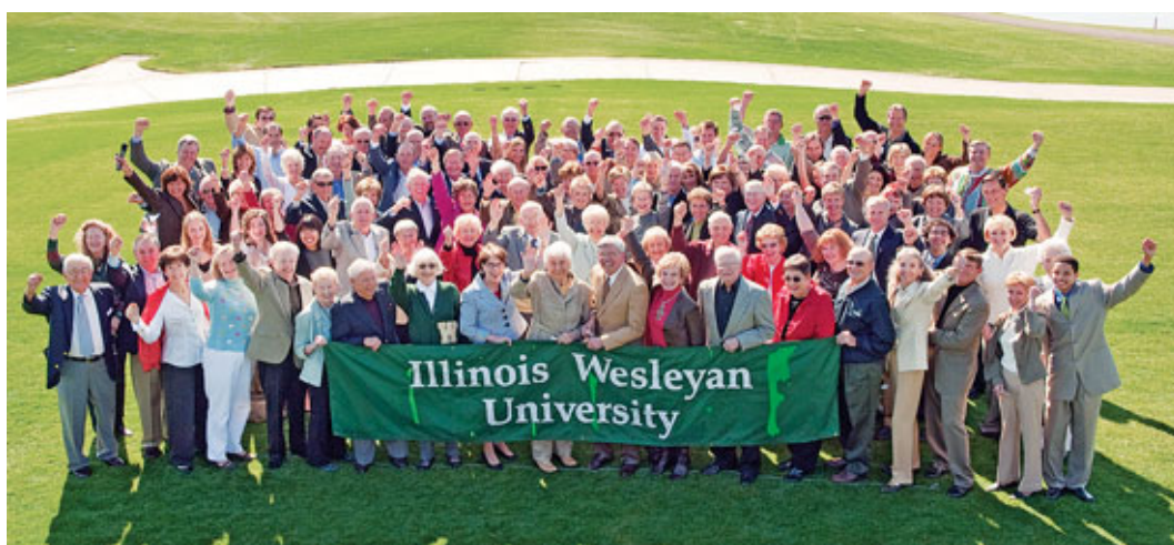
Illinois Wesleyan’s longest-standing alumni event, the Phoenix Connection has grown into one of the most highly attended alumni connections, drawing multi-generational alumni and guests from as far away as California, New Mexico, Illinois, Michigan and Nevada.

Now Illinois Wesleyan’s longest-standing alumni event, the Phoenix Connection has grown into one of the most highly attended alumni connections, drawing multi-generational alumni and guests from as far away as California, New Mexico, Illinois, Michigan and Nevada.